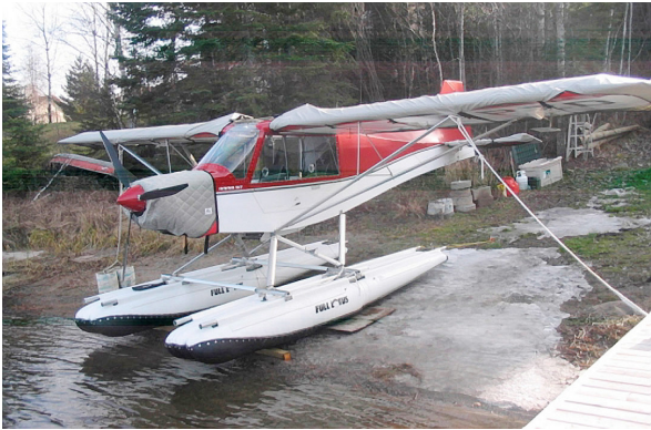
Rans S-7 Insulated Engine, Wing and Horizontal Stabilizer Covers

This cover type is made from Silver Acrylic Sunbrella canvas and is 100% lined with a soft and smooth microfiber. Bruce's Custom Covers developed this material combination especially for aircraft protection. The outer material is medium weight and treated for water resistance, UV resistance and anti-static buildup. The inner lining is a very soft and smooth microfiber to prevent scratching. The material is very reflective, and tests show that the cabin interior temperature can be reduced to near-ambient temperature on the hottest of days. It is water, ice and snow repellent, yet breathable to allow moisture to escape from between the cover and the aircraft surface.