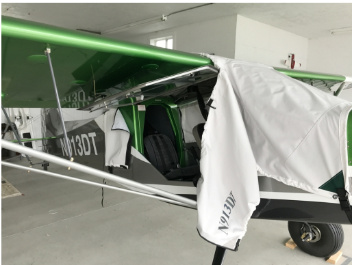
Rans S-7 Courier Canopy Cover (Over-The-Top Style), Belly Strap Type, Lsa Model (S7-S)