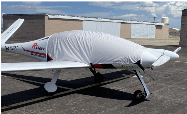
Swiss Excellence Risen 914 Canopy Cover

This cover type is made from Silver Acrylic Sunbrella canvas and is 100% lined with a soft and smooth microfiber. Bruce's Custom Covers developed this material combination especially for aircraft protection. The outer material is medium weight and treated for water resistance, UV resistance and anti-static buildup. The inner lining is a very soft and smooth microfiber to prevent scratching. The material is very reflective, and tests show that the cabin interior temperature can be reduced to near-ambient temperature on the hottest of days. It is water, ice and snow repellent, yet breathable to allow moisture to escape from between the cover and the aircraft surface.