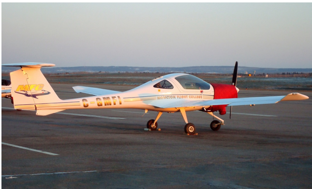
Diamond DA-20 Insulated Engine Cover

This cover type is made from Silver Acrylic Sunbrella canvas and is 100% lined with a soft and smooth microfiber. Bruce's Custom Covers developed this material combination especially for aircraft protection. The outer material is medium weight and treated for water resistance, UV resistance and anti-static buildup. The inner lining is a very soft and smooth microfiber to prevent scratching. The material is very reflective, and tests show that the cabin interior temperature can be reduced to near-ambient temperature on the hottest of days. It is water, ice and snow repellent, yet breathable to allow moisture to escape from between the cover and the aircraft surface.