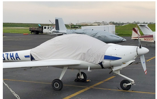
Diamond DA-20 Katana