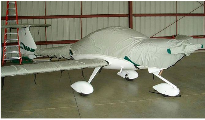
DA-20 Canopy/Engine, Prop/Spinner, Wing, Tailboom, Horiz. Stab. Covers