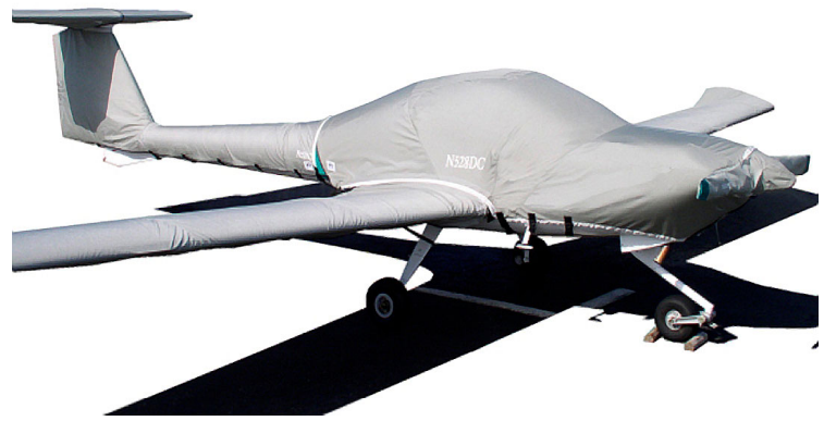
DA-20 Full Cover Set