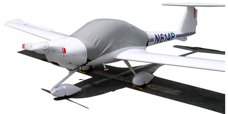
Diamond DA-20 Canopy Cover