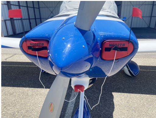
Van's RV-10 Engine Inlet Plugs

Engine Inlet Plugs are custom fit for your Van's Aircraft RV-10 intakes, made with heavy-duty vinyl material, and stuffed with a single block of sculpted urethane foam. Each plug has a zipper that allows the foam to be removed and dried if necessary. Engine plugs have warning flags that are visible from the cockpit or 'remove before flight' streamers sewn onto the face of the plugs. Most plugs are imprinted with the aircraft registration number in black for an extra charge. Storage bag NOT included. Engine plugs may be inserted after flight when the engine is still warm. Engine Inlet Plugs are commonly referred to as Cowl Plugs, Intake Plugs, Cowl Blocks, Engine Blocks, and Engine Bungs.