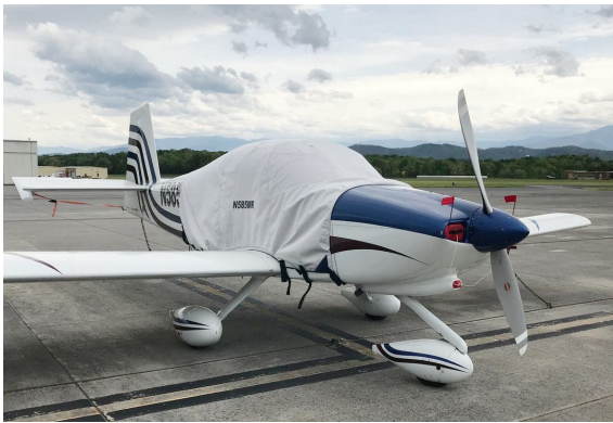
Van's RV-10 Extended Canopy Cover

This cover type is made from Silver Acrylic Sunbrella canvas and is 100% lined with a soft and smooth microfiber. Bruce's Custom Covers developed this material combination especially for aircraft protection. The outer material is medium weight and treated for water resistance, UV resistance and anti-static buildup. The inner lining is a very soft and smooth microfiber to prevent scratching. The material is very reflective, and tests show that the cabin interior temperature can be reduced to near-ambient temperature on the hottest of days. It is water, ice and snow repellent, yet breathable to allow moisture to escape from between the cover and the aircraft surface.