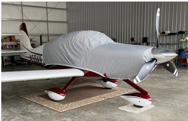
Van's RV-10 Travel Cover

Travel Covers are made with Silver Solution-Dyed Polyester fabric and only lined over the windshield to save weight. The material is lightweight and more compact for easy stowage in the aircraft. The polyester material is water resistant, but only intended for occasional use outside. We also have an ultra lightweight material available for fitted hangar dust covers. For daily outdoor use, the non-travel Sunbrella Cover is the best choice.