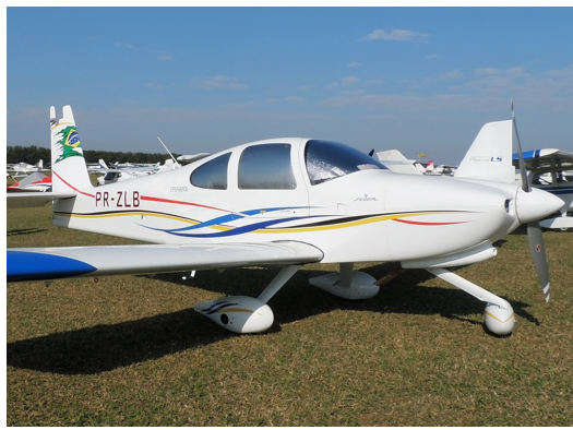
Van's RV-10 HeatShield Set