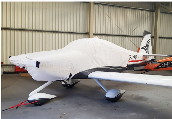
Van's RV-10 Propellor/Spinner Cover

This cover type is made from Silver Acrylic Sunbrella canvas and is 100% lined with a soft and smooth microfiber. Bruce's Custom Covers developed this material combination especially for aircraft protection. The outer material is medium weight and treated for water resistance, UV resistance and anti-static buildup. The inner lining is a very soft and smooth microfiber to prevent scratching. The material is very reflective, and tests show that the cabin interior temperature can be reduced to near-ambient temperature on the hottest of days. It is water, ice and snow repellent, yet breathable to allow moisture to escape from between the cover and the aircraft surface.