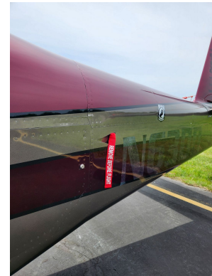
RV-10 Air Vent Wedge Plugs