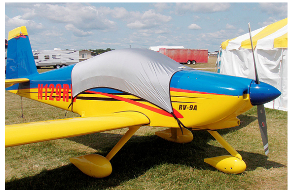
Van's RV-9A Light Weight Travel-Cover