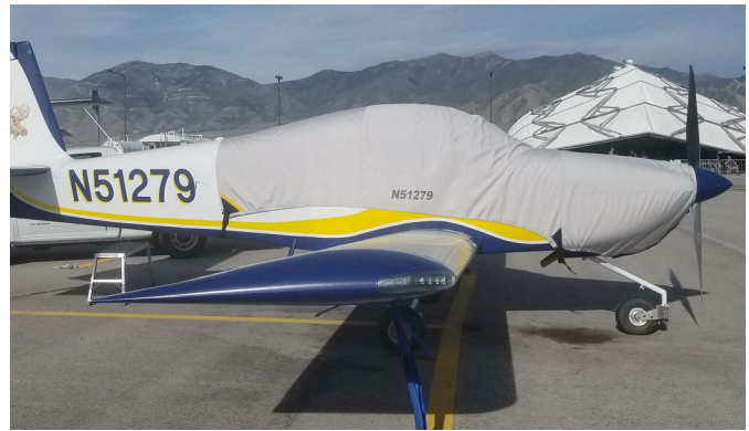
Van's RV-10 Canopy/Engine Cover