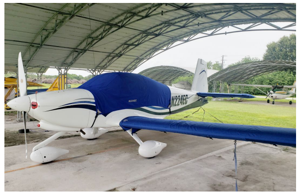
Vans's RV-10 Wing Covers