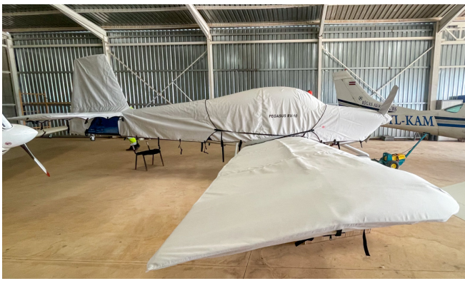
Van's RV-10 Full Cover Set