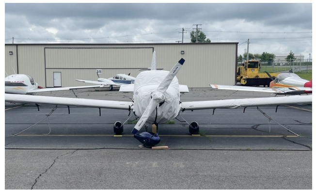
Vans RV-12 Complete Cover Set