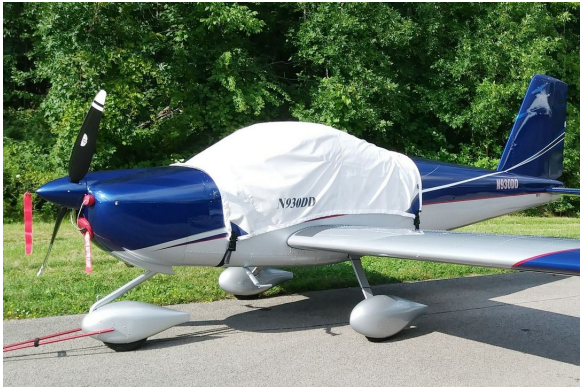
Van's Aircraft RV-12 Canopy Cover