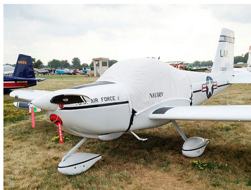
Vans's RV-12 Canopy Cover & Engine Plugs