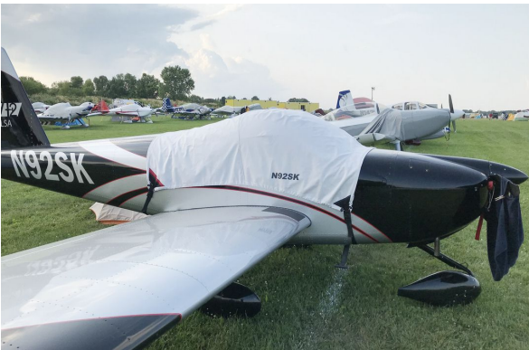
Van's RV-12 Canopy Cover

This cover type is made from Silver Acrylic Sunbrella canvas and is 100% lined with a soft and smooth microfiber. Bruce's Custom Covers developed this material combination especially for aircraft protection. The outer material is medium weight and treated for water resistance, UV resistance and anti-static buildup. The inner lining is a very soft and smooth microfiber to prevent scratching. The material is very reflective, and tests show that the cabin interior temperature can be reduced to near-ambient temperature on the hottest of days. It is water, ice and snow repellent, yet breathable to allow moisture to escape from between the cover and the aircraft surface.