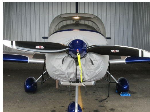
Van's RV-12 Engine Cover, partially enclosed