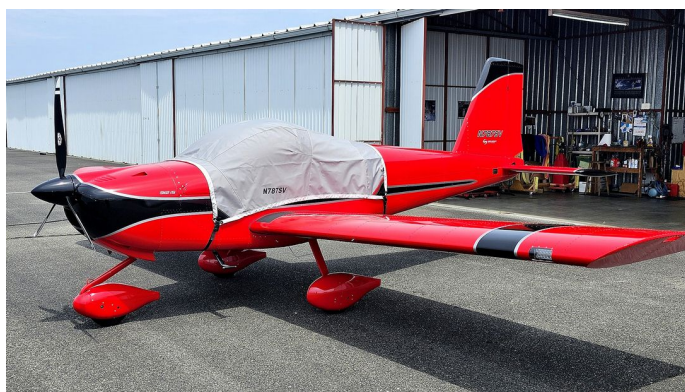
Van's RV-12IS Travel Cover, Light Weight Canopy Cover

Travel Covers are made with Silver Solution-Dyed Polyester fabric and only lined over the windshield to save weight. The material is lightweight and more compact for easy stowage in the aircraft. The polyester material is water resistant, but only intended for occasional use outside. We also have an ultra lightweight material available for fitted hangar dust covers. For daily outdoor use, the non-travel Sunbrella Cover is the best choice.