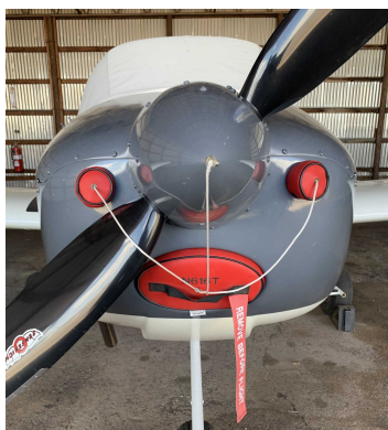
Vans RV-12 Engine Plugs

Engine Inlet Plugs are custom fit for your Van's Aircraft RV-12 & RV-12is intakes, made with heavy-duty vinyl material, and stuffed with a single block of sculpted urethane foam. Each plug has a zipper that allows the foam to be removed and dried if necessary. Engine plugs have warning flags that are visible from the cockpit or 'remove before flight' streamers sewn onto the face of the plugs. Most plugs are imprinted with the aircraft registration number in black for an extra charge. Storage bag NOT included. Engine plugs may be inserted after flight when the engine is still warm. Engine Inlet Plugs are commonly referred to as Cowl Plugs, Intake Plugs, Cowl Blocks, Engine Blocks, and Engine Bunges.