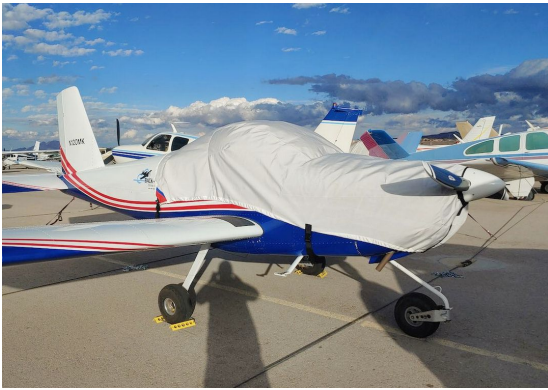
Vans RV-12 Canopy/Engine Cover

Travel Covers are made with Silver Solution-Dyed Polyester fabric and only lined over the windshield to save weight. The material is lightweight and more compact for easy stowage in the aircraft. The polyester material is water resistant, but only intended for occasional use outside. We also have an ultra lightweight material available for fitted hangar dust covers. For daily outdoor use, the non-travel Sunbrella Cover is the best choice.