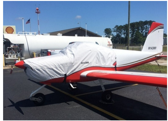
Van's RV-12 Canopy/Engine Cover