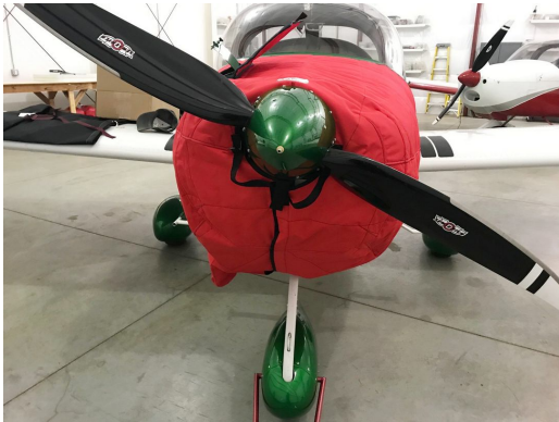
Van's RV-12 Insulated Engine Cover