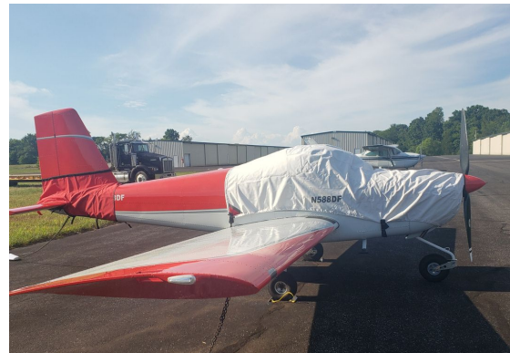
Van's RV-12 Canopy/Engine Cover, Tailcone Cover (raincap type)