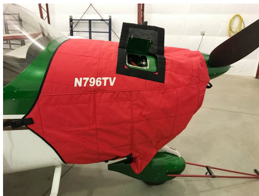
Van's RV-12 Insulated Engine Cover

This cover type is made from Silver Acrylic Sunbrella canvas and is 100% lined with a soft and smooth microfiber. Bruce's Custom Covers developed this material combination especially for aircraft protection. The outer material is medium weight and treated for water resistance, UV resistance and anti-static buildup. The inner lining is a very soft and smooth microfiber to prevent scratching. The material is very reflective, and tests show that the cabin interior temperature can be reduced to near-ambient temperature on the hottest of days. It is water, ice and snow repellent, yet breathable to allow moisture to escape from between the cover and the aircraft surface.