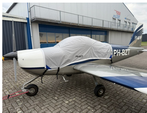
RV-12 Travel Cover, Light Weight Canopy Cover, w/18" forward extension