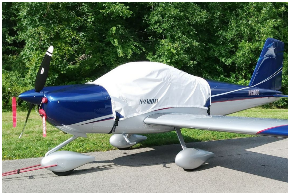
Van's Aircraft RV-12 Canopy Cover

Engine Inlet Plugs are custom fit for your Van's Aircraft RV-12 & RV-12is intakes, made with heavy-duty vinyl material, and stuffed with a single block of sculpted urethane foam. Each plug has a zipper that allows the foam to be removed and dried if necessary. Engine plugs have warning flags that are visible from the cockpit or 'remove before flight' streamers sewn onto the face of the plugs. Most plugs are imprinted with the aircraft registration number in black for an extra charge. Storage bag NOT included. Engine plugs may be inserted after flight when the engine is still warm. Engine Inlet Plugs are commonly referred to as Cowl Plugs, Intake Plugs, Cowl Blocks, Engine Blocks, and Engine Bung.