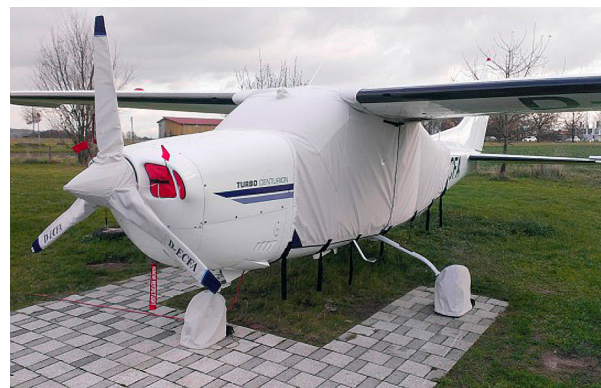
Cessna 210 Extended Canopy Cover, Engine Plugs, Prop and Tire Covers