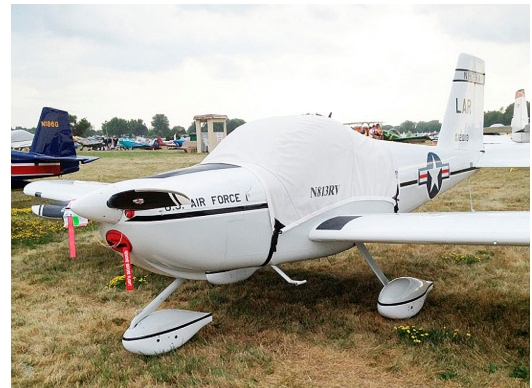
Vans's RV-12 Canopy Cover & Engine Plugs