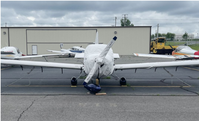
Vans RV-12 Complete Cover Set

This cover type is made from Silver Acrylic Sunbrella canvas and is 100% lined with a soft and smooth microfiber. Bruce's Custom Covers developed this material combination especially for aircraft protection. The outer material is medium weight and treated for water resistance, UV resistance and anti-static buildup. The inner lining is a very soft and smooth microfiber to prevent scratching. The material is very reflective, and tests show that the cabin interior temperature can be reduced to near-ambient temperature on the hottest of days. It is water, ice and snow repellent, yet breathable to allow moisture to escape from between the cover and the aircraft surface.