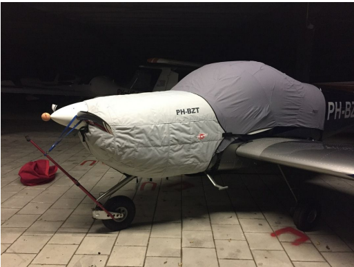
Van's RV-12 Insulated Engine Cover, fully enclosed

This cover type is made from Silver Acrylic Sunbrella canvas and is 100% lined with a soft and smooth microfiber. Bruce's Custom Covers developed this material combination especially for aircraft protection. The outer material is medium weight and treated for water resistance, UV resistance and anti-static buildup. The inner lining is a very soft and smooth microfiber to prevent scratching. The material is very reflective, and tests show that the cabin interior temperature can be reduced to near-ambient temperature on the hottest of days. It is water, ice and snow repellent, yet breathable to allow moisture to escape from between the cover and the aircraft surface.