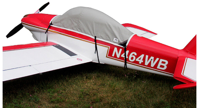
Vans's RV-3 Canopy Cover