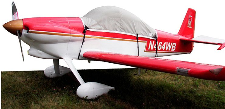
Vans's RV-3 Canopy Cover

This cover type is made from Silver Acrylic Sunbrella canvas and is 100% lined with a soft and smooth microfiber. Bruce's Custom Covers developed this material combination especially for aircraft protection. The outer material is medium weight and treated for water resistance, UV resistance and anti-static buildup. The inner lining is a very soft and smooth microfiber to prevent scratching. The material is very reflective, and tests show that the cabin interior temperature can be reduced to near-ambient temperature on the hottest of days. It is water, ice and snow repellent, yet breathable to allow moisture to escape from between the cover and the aircraft surface.