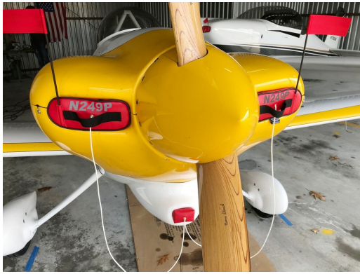
Van's RV-4 Engine Inlet Plugs