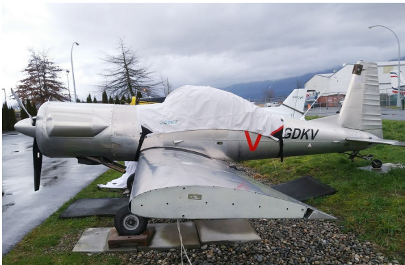
Van's RV-3 (modified) Canopy Cover