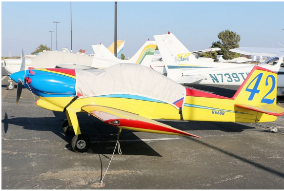
Van's RV-3 Canopy Cover and Engine Plugs