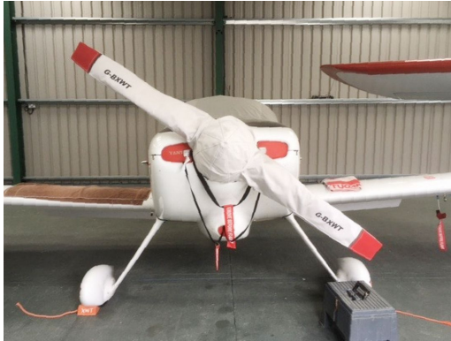
Van's RV-6 Prop/Spinner Cover

This cover type is made from Silver Acrylic Sunbrella canvas and is 100% lined with a soft and smooth microfiber. Bruce's Custom Covers developed this material combination especially for aircraft protection. The outer material is medium weight and treated for water resistance, UV resistance and anti-static buildup. The inner lining is a very soft and smooth microfiber to prevent scratching. The material is very reflective, and tests show that the cabin interior temperature can be reduced to near-ambient temperature on the hottest of days. It is water, ice and snow repellent, yet breathable to allow moisture to escape from between the cover and the aircraft surface.