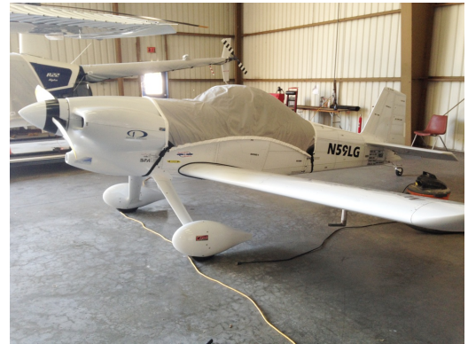
Van's RV-3 Light Weight Travel Cover