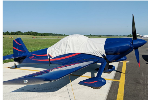
Van's RV-3 Canopy Cover