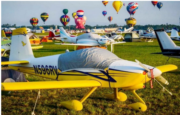
Vans's RV-9 Travel Weight Canopy Cover at Sun 'n Fun

Travel Covers are made with Silver Solution-Dyed Polyester fabric and only lined over the windshield to save weight. The material is lightweight and more compact for easy stowage in the aircraft. The polyester material is water resistant, but only intended for occasional use outside. We also have an ultra lightweight material available for fitted hangar dust covers. For daily outdoor use, the non-travel Sunbrella Cover is the best choice.