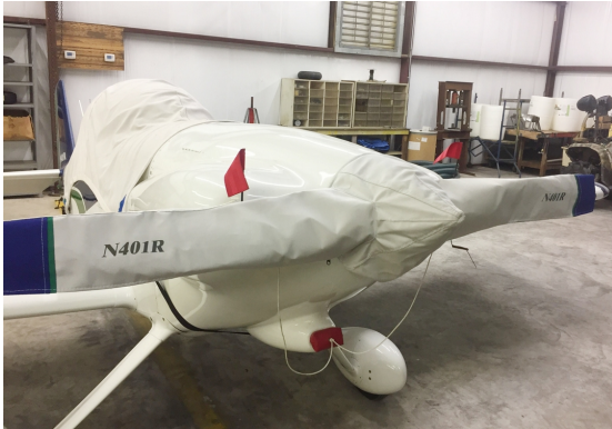
Van's Aircraft RV-4 Propellor/Spinner Cover, 2 Blade

This cover type is made from Silver Acrylic Sunbrella canvas and is 100% lined with a soft and smooth microfiber. Bruce's Custom Covers developed this material combination especially for aircraft protection. The outer material is medium weight and treated for water resistance, UV resistance and anti-static buildup. The inner lining is a very soft and smooth microfiber to prevent scratching. The material is very reflective, and tests show that the cabin interior temperature can be reduced to near-ambient temperature on the hottest of days. It is water, ice and snow repellent, yet breathable to allow moisture to escape from between the cover and the aircraft surface.