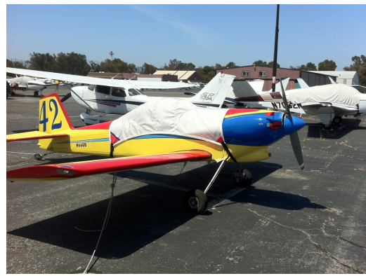
Vans's RV-3 Canopy Cover, Engine Plugs