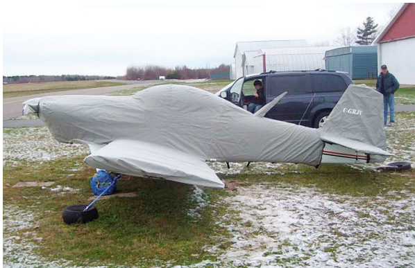
Van's RV-4 Complete Fuselage/Wing/Tail Surfaces cover

This cover type is made from Silver Acrylic Sunbrella canvas and is 100% lined with a soft and smooth microfiber. Bruce's Custom Covers developed this material combination especially for aircraft protection. The outer material is medium weight and treated for water resistance, UV resistance and anti-static buildup. The inner lining is a very soft and smooth microfiber to prevent scratching. The material is very reflective, and tests show that the cabin interior temperature can be reduced to near-ambient temperature on the hottest of days. It is water, ice and snow repellent, yet breathable to allow moisture to escape from between the cover and the aircraft surface.