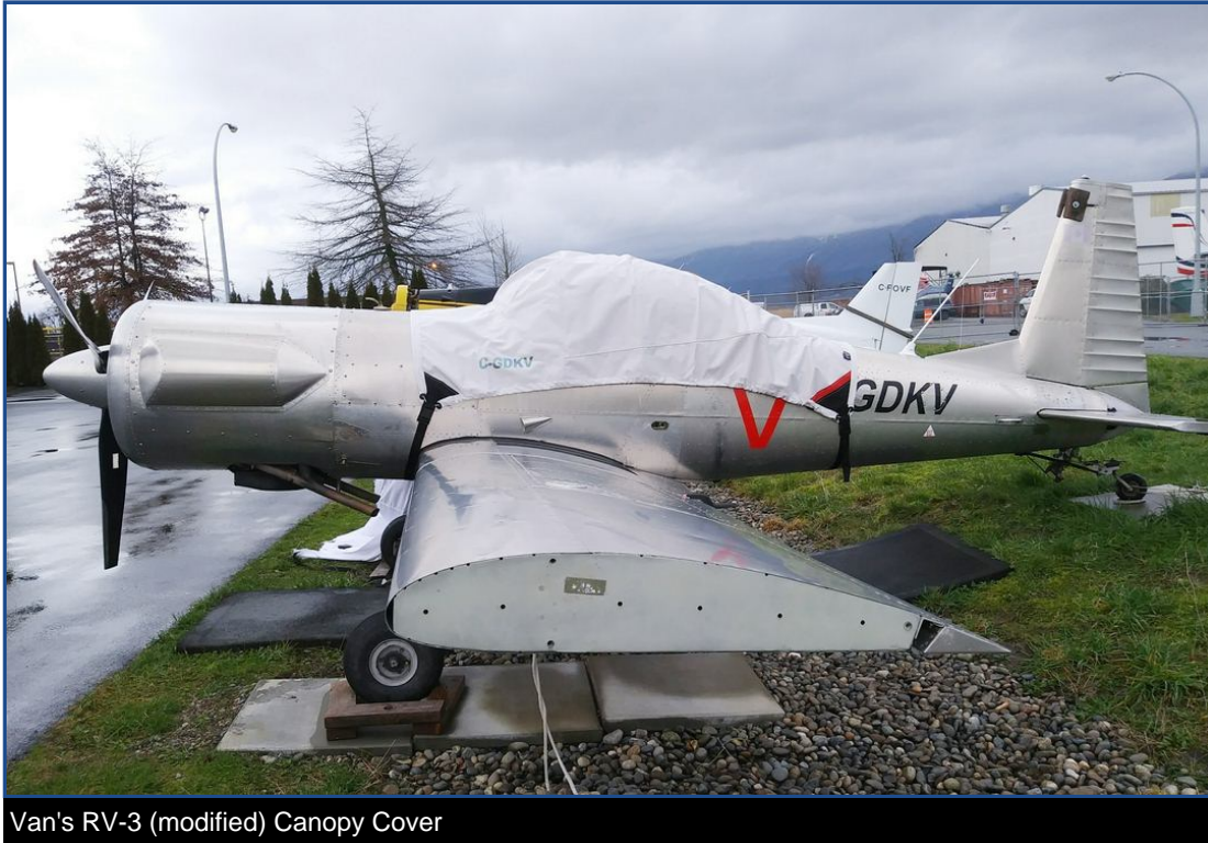
Van's RV-3 (modified) Canopy Cover