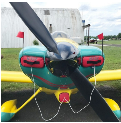
Van's Aircraft RV-4 Engine Inlet Plugs