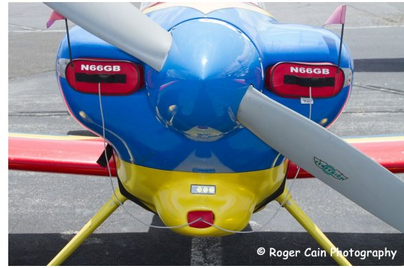
Van's RV-3 Engine Plugs