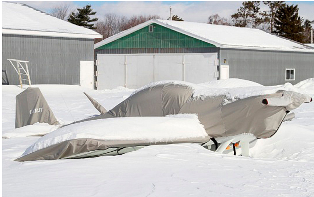
Van's RV-4 Complete Fuselage Cover

This cover type is made from Silver Acrylic Sunbrella canvas and is 100% lined with a soft and smooth microfiber. Bruce's Custom Covers developed this material combination especially for aircraft protection. The outer material is medium weight and treated for water resistance, UV resistance and anti-static buildup. The inner lining is a very soft and smooth microfiber to prevent scratching. The material is very reflective, and tests show that the cabin interior temperature can be reduced to near-ambient temperature on the hottest of days. It is water, ice and snow repellent, yet breathable to allow moisture to escape from between the cover and the aircraft surface.