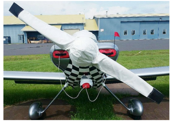
Van's RV-3 Engine Plugs, Prop/Spinner Cover