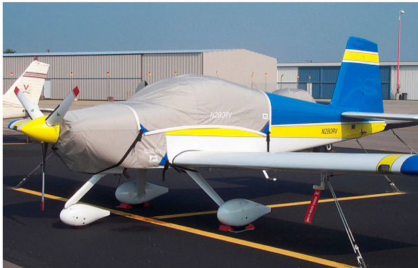
Van's RV-9 Canopy & Engine Covers

This cover type is made from Silver Acrylic Sunbrella canvas and is 100% lined with a soft and smooth microfiber. Bruce's Custom Covers developed this material combination especially for aircraft protection. The outer material is medium weight and treated for water resistance, UV resistance and anti-static buildup. The inner lining is a very soft and smooth microfiber to prevent scratching. The material is very reflective, and tests show that the cabin interior temperature can be reduced to near-ambient temperature on the hottest of days. It is water, ice and snow repellent, yet breathable to allow moisture to escape from between the cover and the aircraft surface.