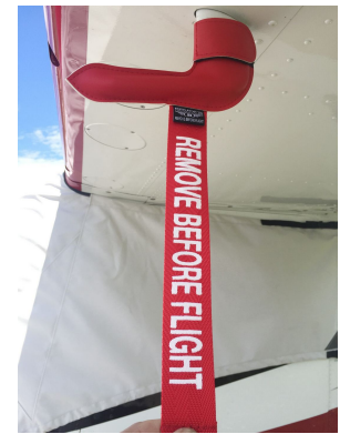
Cessna A185F Pitot Cover