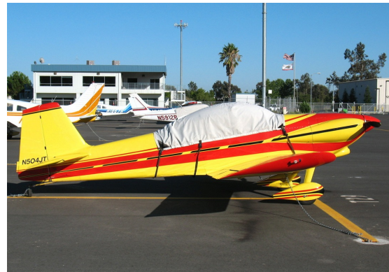
Van's RV-4 Canopy Cover