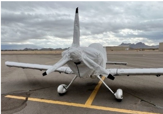
Vans RV-8 Prop Cover, 3-Blade Type

This cover type is made from Silver Acrylic Sunbrella canvas and is 100% lined with a soft and smooth microfiber. Bruce's Custom Covers developed this material combination especially for aircraft protection. The outer material is medium weight and treated for water resistance, UV resistance and anti-static buildup. The inner lining is a very soft and smooth microfiber to prevent scratching. The material is very reflective, and tests show that the cabin interior temperature can be reduced to near-ambient temperature on the hottest of days. It is water, ice and snow repellent, yet breathable to allow moisture to escape from between the cover and the aircraft surface.