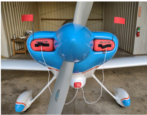
Van's Aircraft RV-4 Engine Inlet Plugs

Engine Inlet Plugs are custom fit for your Van's Aircraft RV-4 intakes, made with heavy-duty vinyl material, and stuffed with a single block of sculpted urethane foam. Each plug has a zipper that allows the foam to be removed and dried if necessary. Engine plugs have warning flags that are visible from the cockpit or 'remove before flight' streamers sewn onto the face of the plugs. Most plugs are imprinted with the aircraft registration number in black for an extra charge. Storage bag NOT included. Engine plugs may be inserted after flight when the engine is still warm. Engine Inlet Plugs are commonly referred to as Cowl Plugs, Intake Plugs, Cowl Blocks, Engine Blocks, and Engine Bungs.