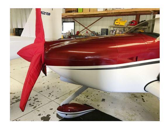
Van's RV-9 Insulated Prop Cover, 3-blade

This cover type is made from Silver Acrylic Sunbrella canvas and is 100% lined with a soft and smooth microfiber. Bruce's Custom Covers developed this material combination especially for aircraft protection. The outer material is medium weight and treated for water resistance, UV resistance and anti-static buildup. The inner lining is a very soft and smooth microfiber to prevent scratching. The material is very reflective, and tests show that the cabin interior temperature can be reduced to near-ambient temperature on the hottest of days. It is water, ice and snow repellent, yet breathable to allow moisture to escape from between the cover and the aircraft surface.