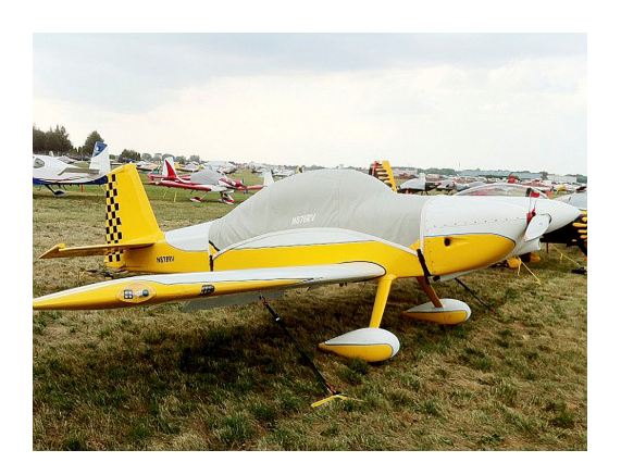
Van's RV-8 Canopy Cover & Engine Inlet Plugs