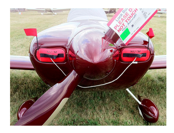
Van's RV-8 Engine Inlet Plugs

Engine Inlet Plugs are custom fit for your Van's Aircraft RV-8/8A intakes, made with heavy-duty vinyl material, and stuffed with a single block of sculpted urethane foam. Each plug has a zipper that allows the foam to be removed and dried if necessary. Engine plugs have warning flags that are visible from the cockpit or 'remove before flight' streamers sewn onto the face of the plugs. Most plugs are imprinted with the aircraft registration number in black for an extra charge. Storage bag NOT included. Engine plugs may be inserted after flight when the engine is still warm. Engine Inlet Plugs are commonly referred to as Cowl Plugs, Intake Plugs, Cowl Blocks, Engine Blocks, and Engine Bungs.