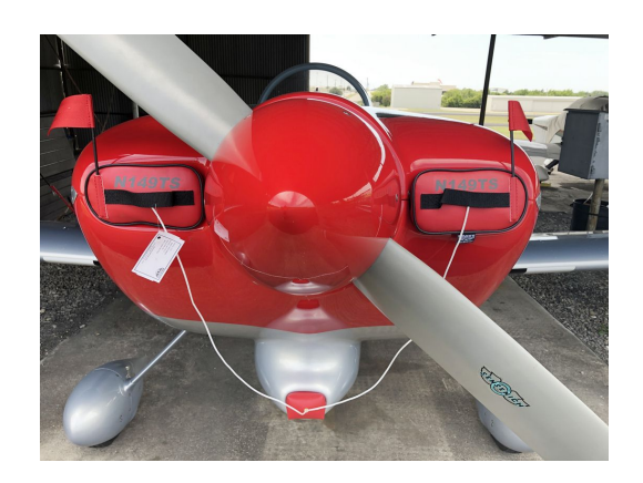
Van's RV-8 Engine Plugs, set of 3