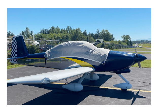
RV-8A Travel Canopy Cover