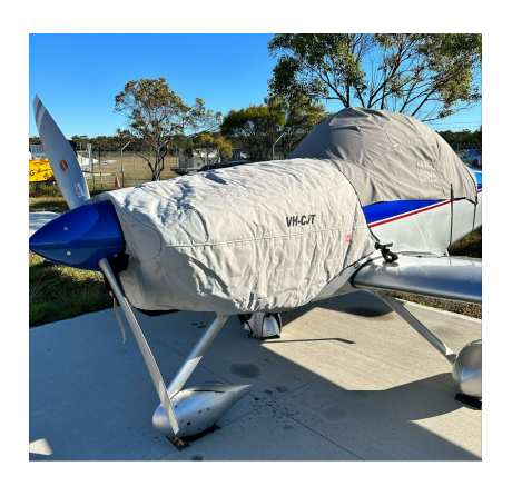
Van's RV-8 Insulated Engine Cover