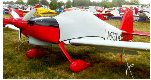
Light Weight Fitted Hangar Dust Cover