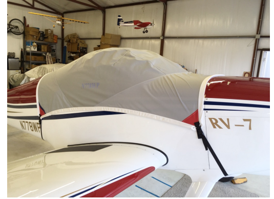
Van's RV-7 Travel Canopy Cover