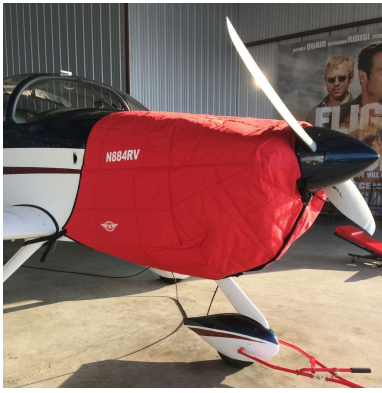
Van's RV-9A Insulated Engine Cover