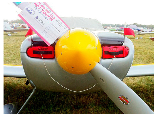
Vans's RV-7 Engine Engine Inlet Plugs