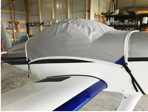
Van's Aircraft RV-9 Travel Cover, Light Weight Travel Canopy Cover

lightweight and more compact for easy stowage in the aircraft. The polyester material is water resistant, but only intended for occasional use outside. We also have an ultra lightweight material available for fitted hangar dust covers. For daily outdoor use, the non-travel Sunbrella Cover is the best choice.