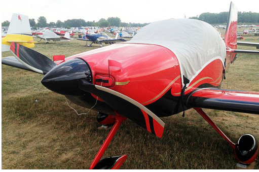
Van's RV-7 Canopy Cover & Engine Inlet Plugs