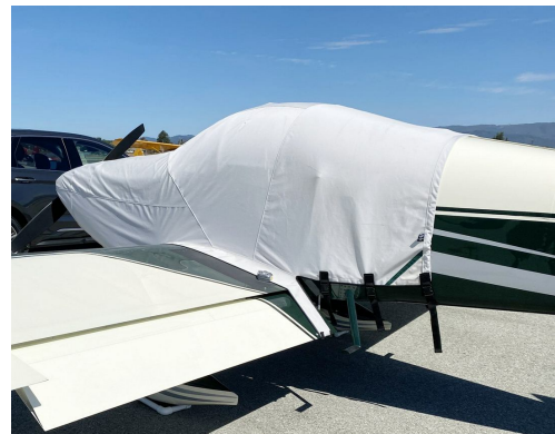
Van's RV-9A Extended Canopy/Engine Cover