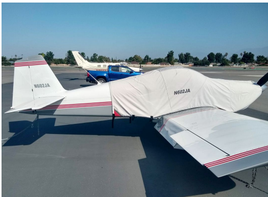
Van's RV-6 Extended Canopy/Engine Cover

This cover type is made from Silver Acrylic Sunbrella canvas and is 100% lined with a soft and smooth microfiber. Bruce's Custom Covers developed this material combination especially for aircraft protection. The outer material is medium weight and treated for water resistance, UV resistance and anti-static buildup. The inner lining is a very soft and smooth microfiber to prevent scratching. The material is very reflective, and tests show that the cabin interior temperature can be reduced to near-ambient temperature on the hottest of days. It is water, ice and snow repellent, yet breathable to allow moisture to escape from between the cover and the aircraft surface.