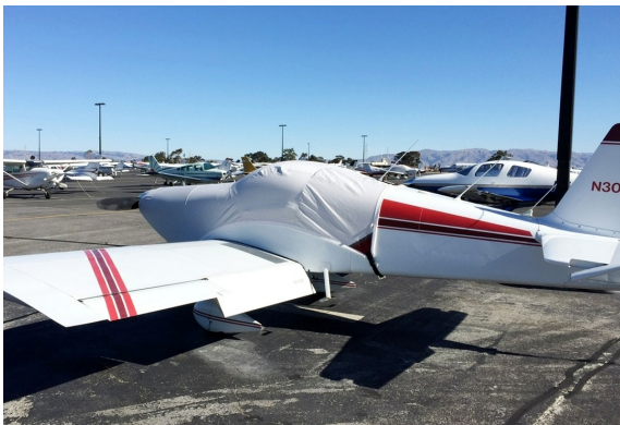
Van's RV-6A Canopy/Engine Cover

This cover type is made from Silver Acrylic Sunbrella canvas and is 100% lined with a soft and smooth microfiber. Bruce's Custom Covers developed this material combination especially for aircraft protection. The outer material is medium weight and treated for water resistance, UV resistance and anti-static buildup. The inner lining is a very soft and smooth microfiber to prevent scratching. The material is very reflective, and tests show that the cabin interior temperature can be reduced to near-ambient temperature on the hottest of days. It is water, ice and snow repellent, yet breathable to allow moisture to escape from between the cover and the aircraft surface.