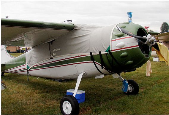
Cessna 195 Canopy Cover, extended forward and over gas caps

The material is very reflective, and tests show that the cabin interior temperature can be reduced to near-ambient temperature on the hottest of days. It is water, ice and snow repellent, yet breathable to allow moisture to escape from between the cover and the aircraft surface.