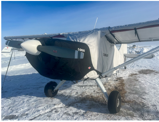
Stinson 108 Winter Cover Set