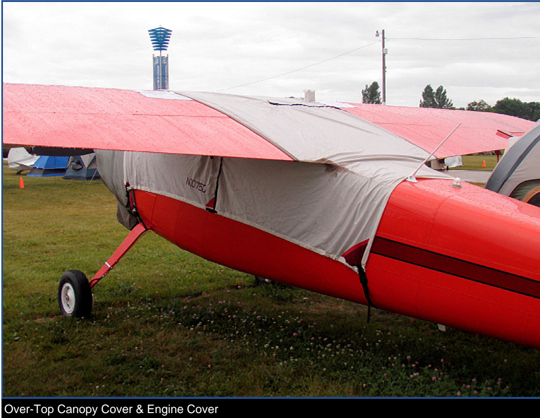
Over-Top Canopy Cover &amp; Engine Cover