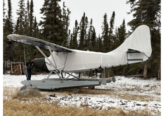
Stinson 108 Cover Set