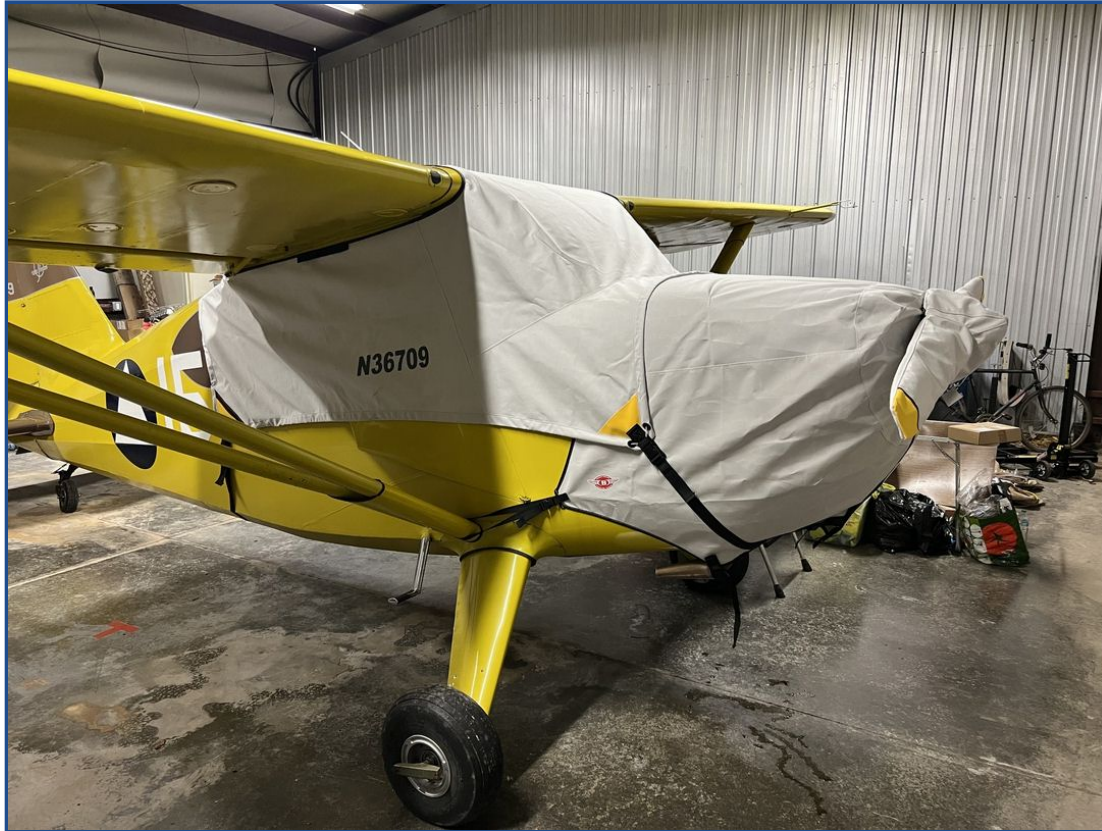
Stinson 10 Canopy, Engine &amp; Prop Covers