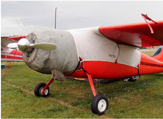
Cessna 195 Over-Top Canopy Cover & Engine Cover

The material is very reflective, and tests show that the cabin interior temperature can be reduced to near-ambient temperature on the hottest of days. It is water, ice and snow repellent, yet breathable to allow moisture to escape from between the cover and the aircraft surface.