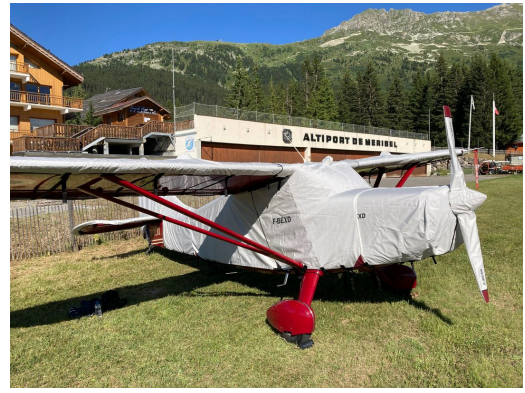
Stinson 108-3 Voyager Cover Set