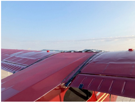
Stinson 108 Windshield Cover