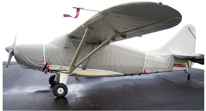
Stinson 108 Canopy, Engine, Prop & Empennage Covers