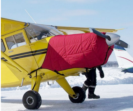
Stinson 108 Insulated Engine Cover, not fully enclosed

This cover type is made from Silver Acrylic Sunbrella canvas and is 100% lined with a soft and smooth microfiber. Bruce's Custom Covers developed this material combination especially for aircraft protection. The outer material is medium weight and treated for water resistance, UV resistance and anti-static buildup. The inner lining is a very soft and smooth microfiber to prevent scratching. The material is very reflective, and tests show that the cabin interior temperature can be reduced to near-ambient temperature on the hottest of days. It is water, ice and snow repellent, yet breathable to allow moisture to escape from between the cover and the aircraft surface.