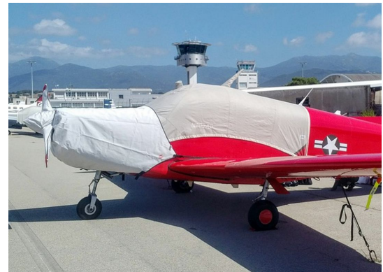
Siai Marchetti S.205/208 Canopy, Engine & Prop Covers