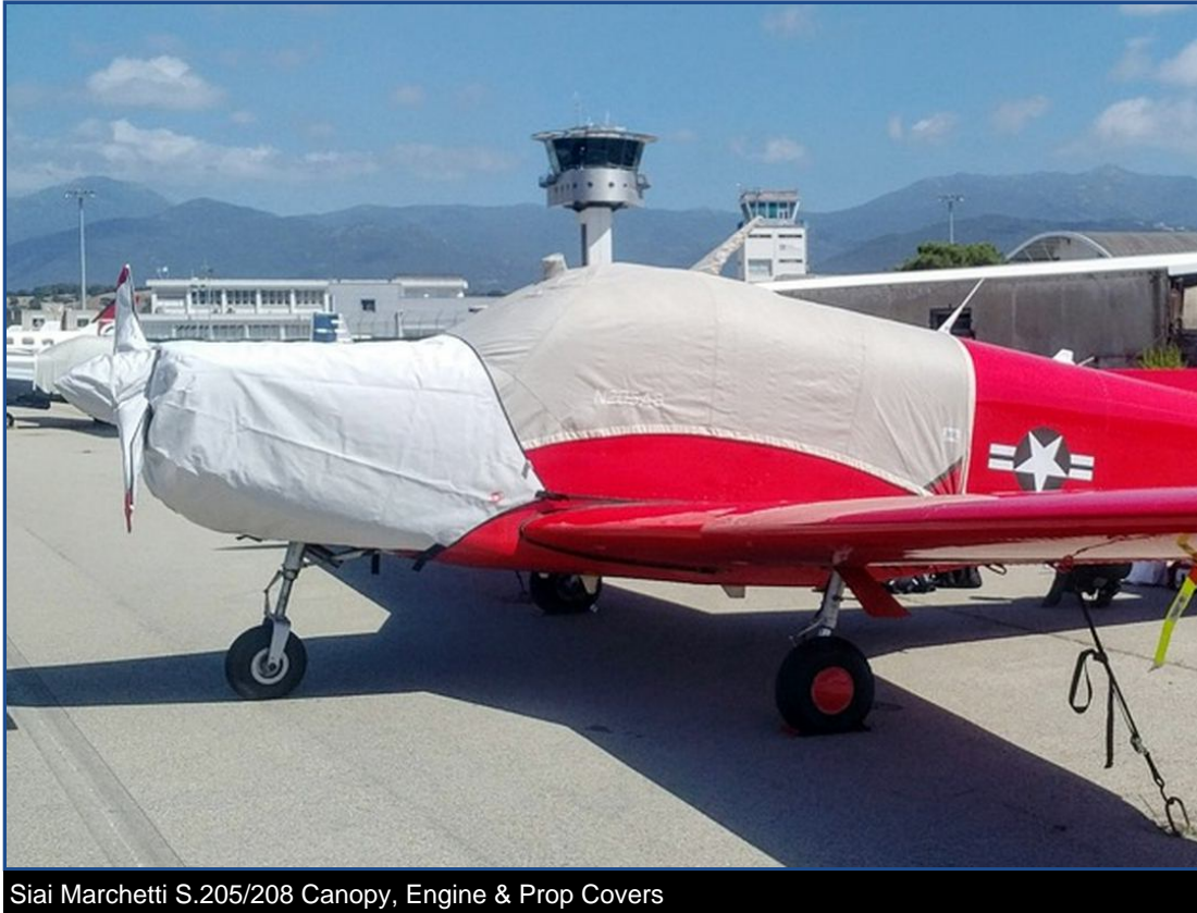
Siai Marchetti S.205/208 Canopy, Engine &amp; Prop Covers