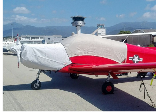
Siai Marchetti S.205/208 Canopy, Engine & Prop Covers