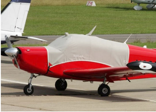
Siai Marchetti S.205/208 Canopy Cover

The Siai Marchetti S.205/S.208 Canopy/Engine Cover is a one-piece cover (100% lined with microfiber) that is a combination of the Canopy Cover and Engine Cover. This cover will enclose the engine cowl and will extend aft to cover all of the windows. This cover type is made from Silver Acrylic Sunbrella canvas and is 100% lined with a soft and smooth microfiber. Bruce's Custom Covers developed this material combination especially for aircraft protection. The outer material is medium weight and treated for water resistance, UV resistance and anti-static buildup. The inner lining is a very soft and smooth microfiber to prevent scratching. The material is very reflective, and tests show that the cabin interior temperature can be reduced to near-ambient temperature on the hottest of days. It is water, ice and snow repellent, yet breathable to allow moisture to escape from between the cover and the aircraft surface.