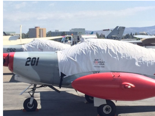
1974 Siai-Marchetti SF 260B Canopy Cover with customized Imprint