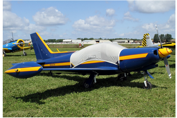
Siai Marchetti SF260 Canopy Cover