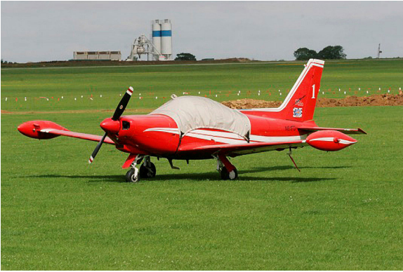
Siai Marchetti SF260 Canopy Cover

Travel Covers are made with Silver Solution-Dyed Polyester fabric and only lined over the windshield to save weight. The material is lightweight and more compact for easy stowage in the aircraft. The polyester material is water resistant, but only intended for occasional use outside. We also have an ultra lightweight material available for fitted hangar dust covers. For daily outdoor use, the non-travel Sunbrella Cover is the best choice.