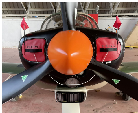
Marcheti SF260C Inlet Plugs