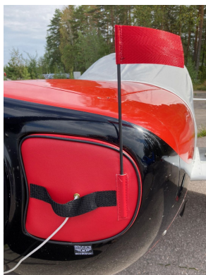
Siai Marchetti SF260 Engine Plugs

Engine Inlet Plugs are custom fit for your Siai Marchetti SF260 intakes, made with heavy-duty vinyl material, and stuffed with a single block of sculpted urethane foam. Each plug has a zipper that allows the foam to be removed and dried if necessary. Engine plugs have warning flags that are visible from the cockpit or 'remove before flight' streamers sewn onto the face of the plugs. Most plugs are imprinted with the aircraft registration number in black for an extra charge. Storage bag NOT included. Engine plugs may be inserted after flight when the engine is still warm. Engine Inlet Plugs are commonly referred to as Cowl Plugs, Intake Plugs, Cowl Blocks, Engine Blocks, and Engine Bungs.