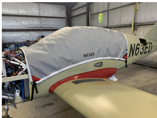
Swearingen SX300 Travel Weight Canopy Cover

Travel Covers are made with Silver Solution-Dyed Polyester fabric and only lined over the windshield to save weight. The material is lightweight and more compact for easy stowage in the aircraft. The polyester material is water resistant, but only intended for occasional use outside. We also have an ultra lightweight material available for fitted hangar dust covers. For daily outdoor use, the non-travel Sunbrella Cover is the best choice.