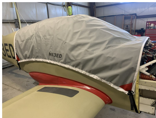
Swearingen SX300 Travel Weight Canopy Cover