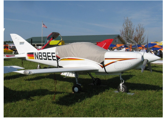
The Swearingen SX300 Canopy Cover