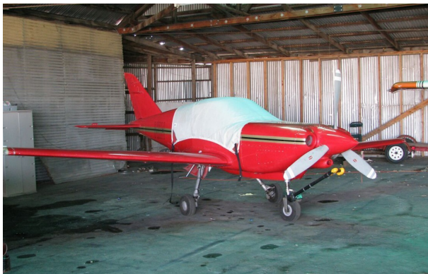
The Swearingen SX300 Canopy Cover