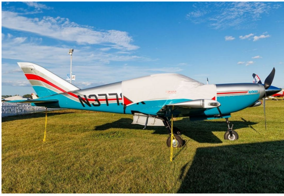
Swearingen SX300 Canopy Cover