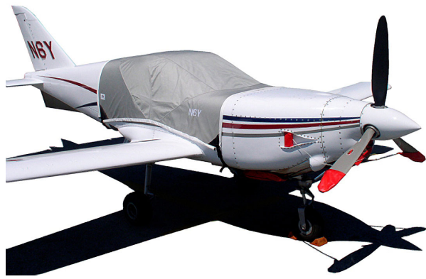
The Swearingen SX300 Canopy Cover, Engine Plugs & Prop Ties