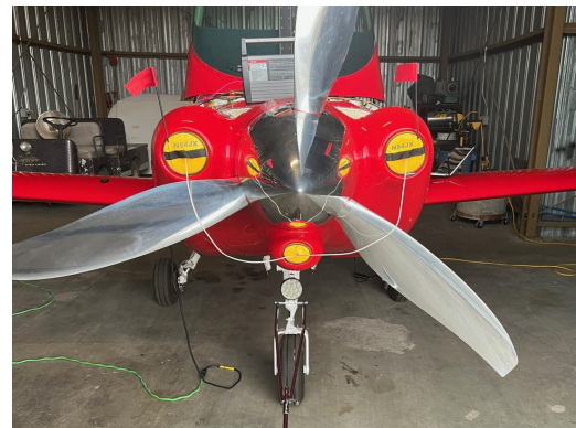
Swearingen SX-300 Engine Plugs