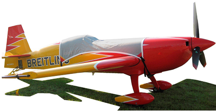
Extra 300sc Canopy Cover