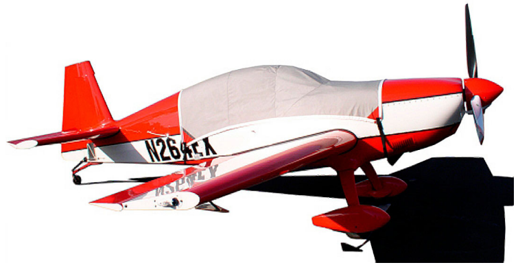
Canopy Cover for the Extra 300