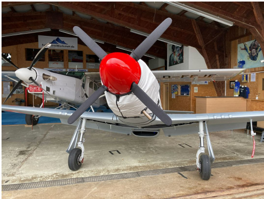
SW-51 Mustang Engine Cover

This cover type is made from Silver Acrylic Sunbrella canvas and is 100% lined with a soft and smooth microfiber. Bruce's Custom Covers developed this material combination especially for aircraft protection. The outer material is medium weight and treated for water resistance, UV resistance and anti-static buildup. The inner lining is a very soft and smooth microfiber to prevent scratching. The material is very reflective, and tests show that the cabin interior temperature can be reduced to near-ambient temperature on the hottest of days. It is water, ice and snow repellent, yet breathable to allow moisture to escape from between the cover and the aircraft surface.