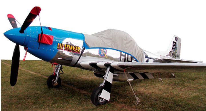
Stewart Mustang Canopy Cover, Prop Tie Downs & Intake Plugs