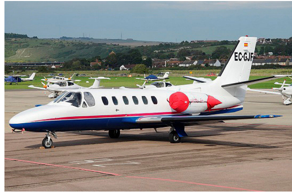
Cessna Citation II Engine Covers, Pitot Covers