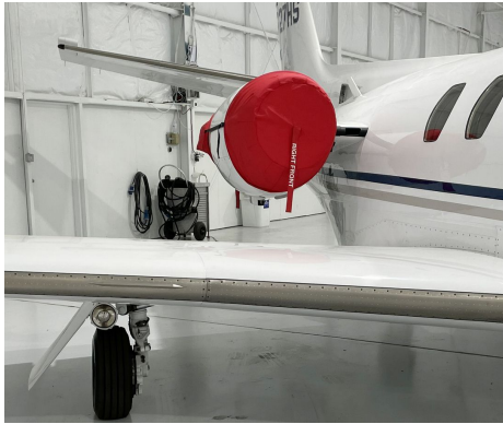
Cessna Citation S550 Intake/Exhaust Covers

and dried if necessary. Engine plugs have 'remove before flight' streamers sewn onto the face of the plugs. Most plugs are imprinted with the aircraft registration number in black. Engine plugs may be inserted after flight when the engine is still warm. Engine Inlet Plugs are commonly referred to as Cowl Plugs, Intake Plugs, Cowl Blocks, Engine Blocks, and Engine Bungs.