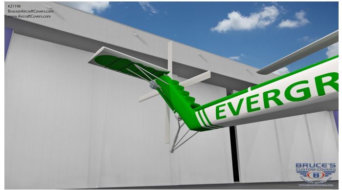
Sikorsky S-64 Skycrane, CH-54 Tarhe Insulated Engine, Rotor Sikorsky S-64 Canopy/Nose, Engine Area, Blade, Rotor, Tail Rotor Hub, Tailboom, Stabilizer & Tail Rotor Covers Sikorsky S-64 Canopy/Nose, Engine Area, Blade, Rotor, Tail Rotor Covers (illustration)