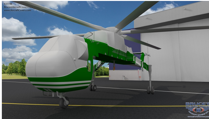
Sikorsky S-64 Canopy/Nose, Engine Area, Blade, Rotor, Tail Rotor Covers (illustration)

Travel Covers are made with Silver Solution-Dyed Polyester fabric and fully lined over the entire cover. The material is lightweight and more compact for easy stowage in the aircraft. The polyester material is water resistant, but only intended for occasional use outside. We also have an ultra lightweight material available for fitted hangar dust covers. For daily outdoor use, the non-travel Sunbrella Cover is the best choice.