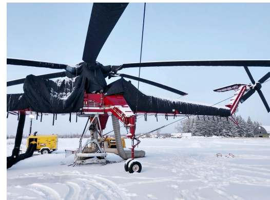
Sikorsky S-64 Canopy/Nose, Engine Area, Blade, Rotor, Tail Rotor Sikorsky S-64 Skycrane, CH-54 Tarhe Insulated Engine, Rotor Hub, Tailboom, Stabilizer & Tail Rotor Covers Sikorsky S-64 Skycrane, CH-54 Tarhe Insulated Engine, Rotor Hub, Tailboom, Stabilizer & Tail Rotor Covers (illustration)