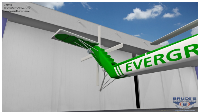
Sikorsky S-64 Skycrane, CH-54 Tarhe Insulated Engine, Rotor Sikorsky S-64 Canopy/Nose, Engine Area, Blade, Rotor, Tail Rotor Hub, Tailboom, Stabilizer & Tail Rotor Covers (illustration)