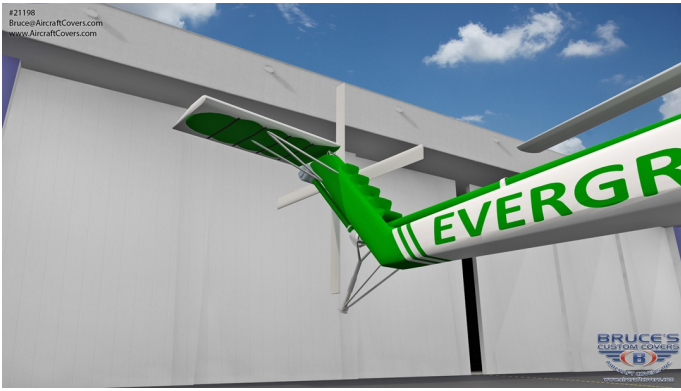
Sikorsky S-64 Canopy/Nose, Engine Area, Blade, Rotor, Tail Rotor Covers (illustration)