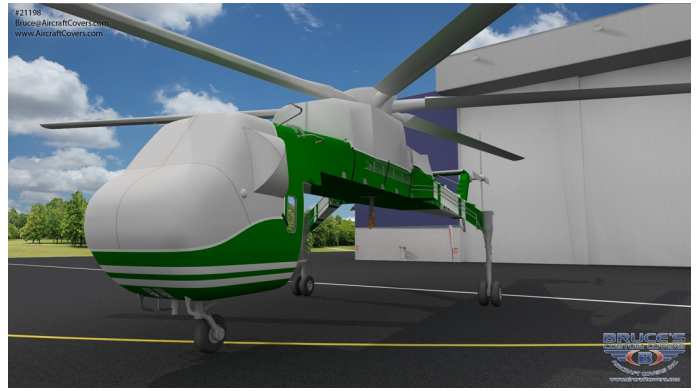
Sikorsky S-64 Canopy/Nose, Engine Area, Blade, Rotor, Tail Rotor Covers (illustration)