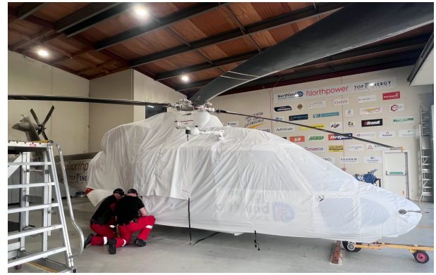
Sikorsky S76C Forward Canopy Cover, Engine Cover (test fit covers)