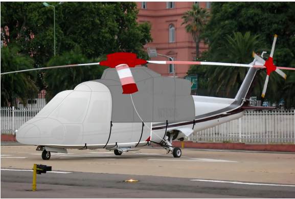
S76 Forward Fuselage, Engine, Main & Tail Rotor Hub Covers (illustration)

WINTER USE MATERIAL - Made with Solution-Dyed Polyester fabric, this option is intended for seasonal use to aid in deicing, rain mitigation, or for occasional travel. The material is lighter and more compact, but more susceptible to UV damage and may have a shorter useful life if used continuously outside than the all-year use material.