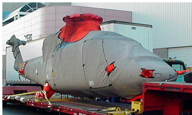
S76 Full Body Transport Cover