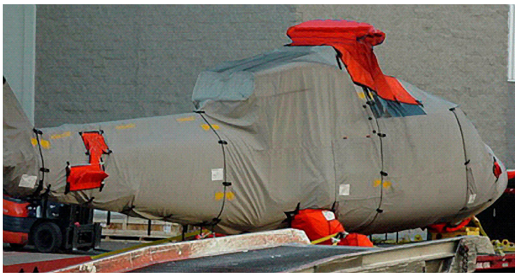
S76 Full Body Transport Cover