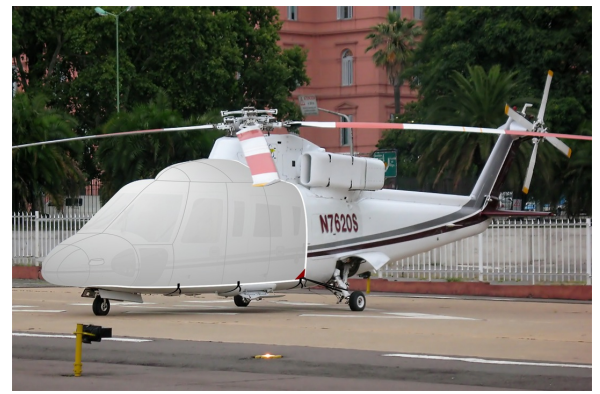
Sikorsky S76 Bubble Cover (Forward Canopy Cover)