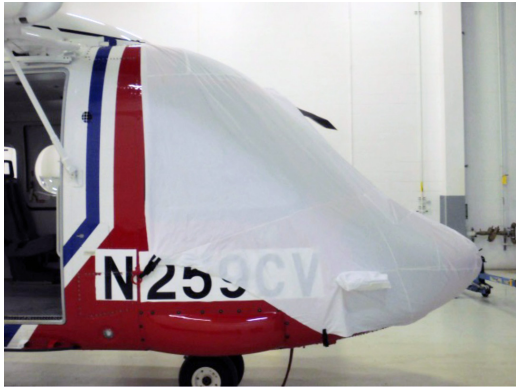
Sikorsky S-92 Windshield/Nose Cover, test fit cover

This cover type is made from Silver Acrylic Sunbrella canvas and is 100% lined with a soft and smooth microfiber. Bruce's Custom Covers developed this material combination especially for aircraft protection. The outer material is medium weight and treated for water resistance, UV resistance and anti-static buildup. The inner lining is a very soft and smooth microfiber to prevent scratching. The material is very reflective, and tests show that the cabin interior temperature can be reduced to near-ambient temperature on the hottest of days. It is water, ice and snow repellent, yet breathable to allow moisture to escape from between the cover and the aircraft surface.