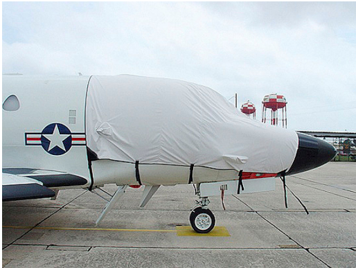
Sabre 40 Cockpit Cover

This cover type is made from Silver Acrylic Sunbrella canvas and is 100% lined with a soft and smooth microfiber. Bruce's Custom Covers developed this material combination especially for aircraft protection. The outer material is medium weight and treated for water resistance, UV resistance and anti-static buildup. The inner lining is a very soft and smooth microfiber to prevent scratching. The material is very reflective, and tests show that the cabin interior temperature can be reduced to near-ambient temperature on the hottest of days. It is water, ice and snow repellent, yet breathable to allow moisture to escape from between the cover and the aircraft surface.