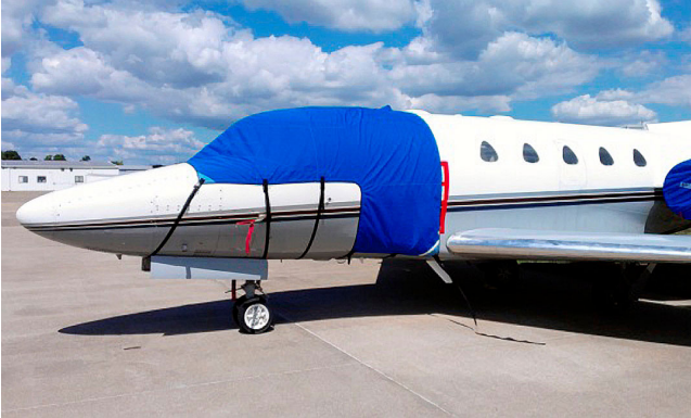
Rockwell Sabre Cockpit/Door Cover

This cover type is made from Silver Acrylic Sunbrella canvas and is 100% lined with a soft and smooth microfiber. Bruce's Custom Covers developed this material combination especially for aircraft protection. The outer material is medium weight and treated for water resistance, UV resistance and anti-static buildup. The inner lining is a very soft and smooth microfiber to prevent scratching. The material is very reflective, and tests show that the cabin interior temperature can be reduced to near-ambient temperature on the hottest of days. It is water, ice and snow repellent, yet breathable to allow moisture to escape from between the cover and the aircraft surface.