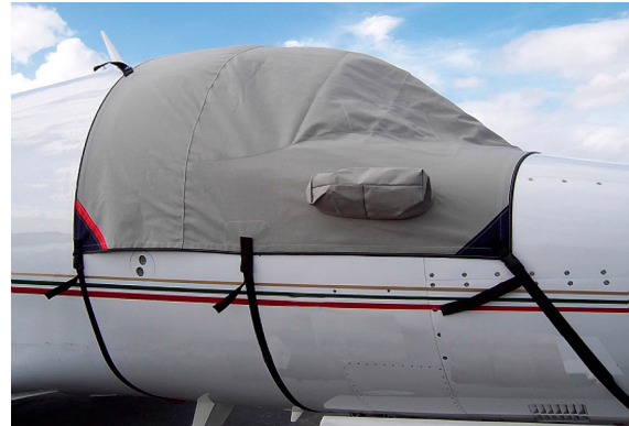
Sabre Cockpit Cover