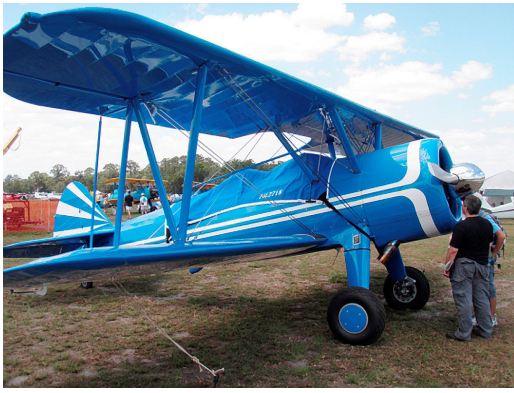
Stearman Canopy Cover (std. color is silver)