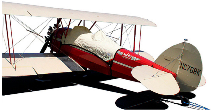
Waco 10 Canopy Cover