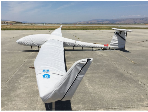
Schemp-Hirth Discus 2B Full Cover Set