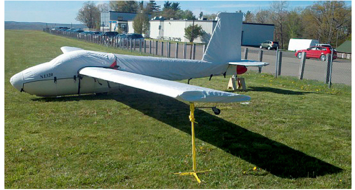
SGS 1-26B Canopy/Nose, Empennage & Wing Covers