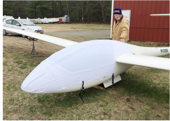
Grob 102 Astir CS Canopy/Nose Cover (test fit)