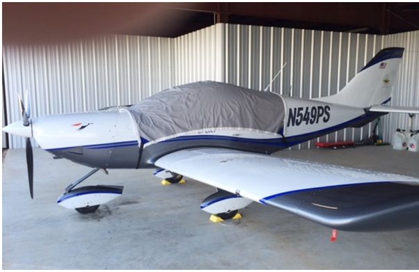
PiperSport Light Weight Travel Cover