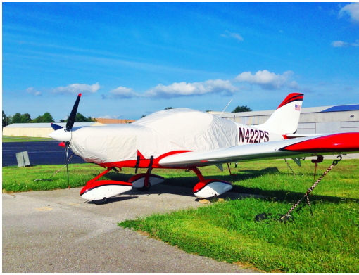
SportCruiser Canopy/Engine Cover