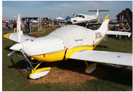
PiperSport Canopy Cover, Engine Plugs