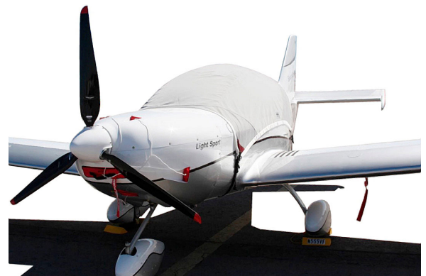
Sportcruiser Canopy Cover & Plugs