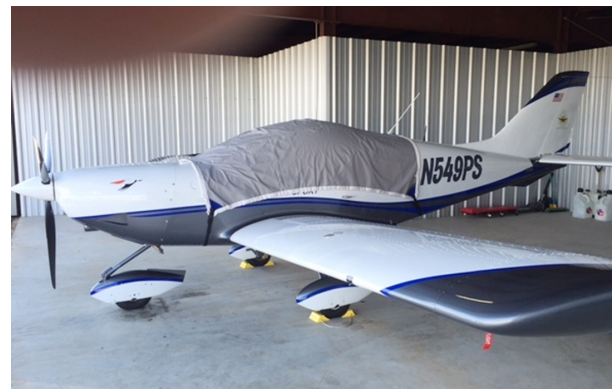
PiperSport Light Weight Travel Cover