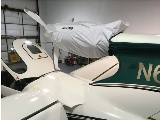
Seawind 3000 Custom Engine Cover

This cover type is made from Silver Acrylic Sunbrella canvas and is 100% lined with a soft and smooth microfiber. Bruce's Custom Covers developed this material combination especially for aircraft protection. The outer material is medium weight and treated for water resistance, UV resistance and anti-static buildup. The inner lining is a very soft and smooth microfiber to prevent scratching. The material is very reflective, and tests show that the cabin interior temperature can be reduced to near-ambient temperature on the hottest of days. It is water, ice and snow repellent, yet breathable to allow moisture to escape from between the cover and the aircraft surface.