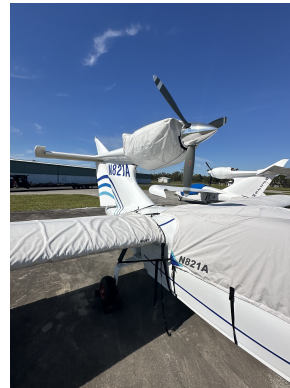
Seawind Seawind 300C & 3000 Amphibian Wing Covers, All Year Use