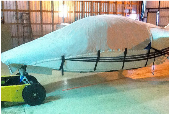
Seawind Canopy/Nose Cover

This cover type is made from Silver Acrylic Sunbrella canvas and is 100% lined with a soft and smooth microfiber. Bruce's Custom Covers developed this material combination especially for aircraft protection. The outer material is medium weight and treated for water resistance, UV resistance and anti-static buildup. The inner lining is a very soft and smooth microfiber to prevent scratching. The material is very reflective, and tests show that the cabin interior temperature can be reduced to near-ambient temperature on the hottest of days. It is water, ice and snow repellent, yet breathable to allow moisture to escape from between the cover and the aircraft surface.