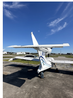
Seawind Seawind 300C & 3000 Amphibian Wing Covers, All Year Use