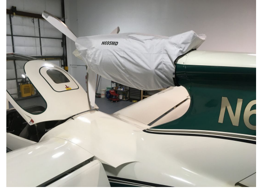
Seawind 3000 Custom Engine Cover