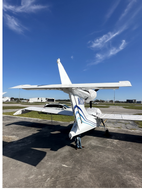
Seawind Seawind 300C & 3000 Amphibian Wing Covers, All Year Use

This cover type is made from Silver Acrylic Sunbrella canvas and is 100% lined with a soft and smooth microfiber. Bruce's Custom Covers developed this material combination especially for aircraft protection. The outer material is medium weight and treated for water resistance, UV resistance and anti-static buildup. The inner lining is a very soft and smooth microfiber to prevent scratching. The material is very reflective, and tests show that the cabin interior temperature can be reduced to near-ambient temperature on the hottest of days. It is water, ice and snow repellent, yet breathable to allow moisture to escape from between the cover and the aircraft surface.