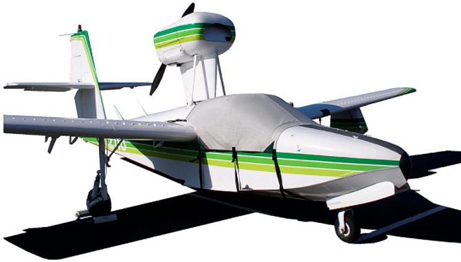
Lake LA-250 Canopy Cover

This cover type is made from Silver Acrylic Sunbrella canvas and is 100% lined with a soft and smooth microfiber. Bruce's Custom Covers developed this material combination especially for aircraft protection. The outer material is medium weight and treated for water resistance, UV resistance and anti-static buildup. The inner lining is a very soft and smooth microfiber to prevent scratching. The material is very reflective, and tests show that the cabin interior temperature can be reduced to near-ambient temperature on the hottest of days. It is water, ice and snow repellent, yet breathable to allow moisture to escape from between the cover and the aircraft surface.