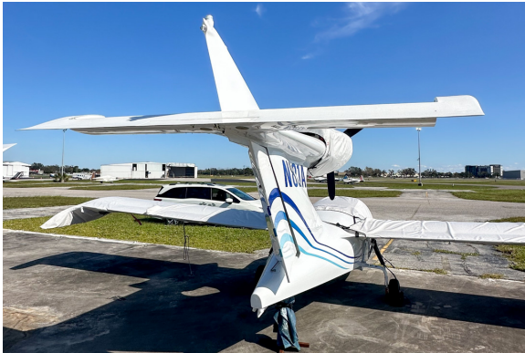
Seawind Seawind 300C & 3000 Amphibian Wing Covers, All Year Use