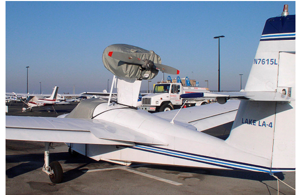
Lake Canopy & Engine Covers