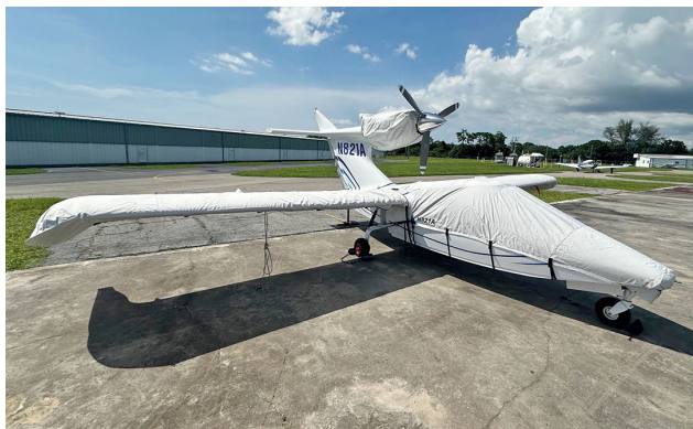
Seawind 3000 Canopy/Nose, Wing & Engine Covers

This cover type is made from Silver Acrylic Sunbrella canvas and is 100% lined with a soft and smooth microfiber. Bruce's Custom Covers developed this material combination especially for aircraft protection. The outer material is medium weight and treated for water resistance, UV resistance and anti-static buildup. The inner lining is a very soft and smooth microfiber to prevent scratching. The material is very reflective, and tests show that the cabin interior temperature can be reduced to near-ambient temperature on the hottest of days. It is water, ice and snow repellent, yet breathable to allow moisture to escape from between the cover and the aircraft surface.