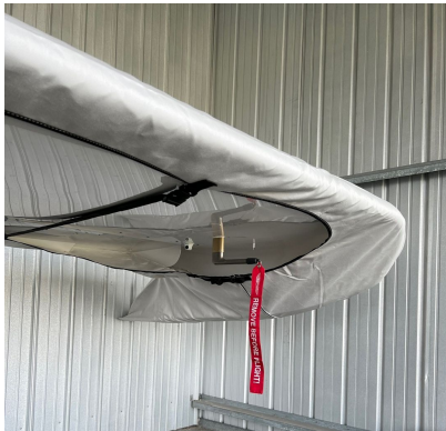
Seawind 300C & 3000 Wing Covers

WINTER USE MATERIAL - Made with Solution-Dyed Polyester fabric, this option is intended for seasonal use to aid in deicing, rain mitigation, or for occasional travel. The material is lighter and more compact, but more susceptible to UV damage and may have a shorter useful life if used continuously outside than the all-year use material.