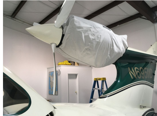
Seawind 3000 Custom Engine Cover