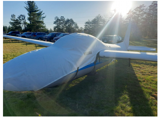
Schweizer 2-32 Full Cover Set