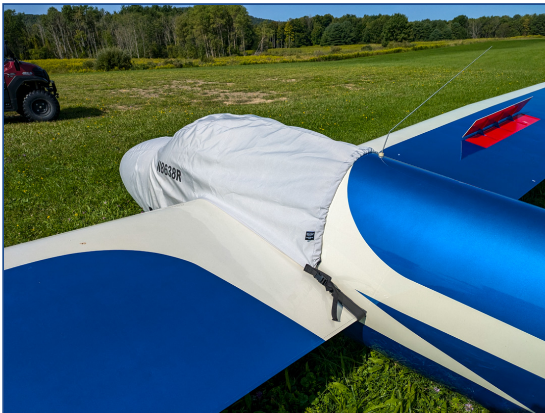
Schweizer 1-23H-15 Canopy/Nose Cover