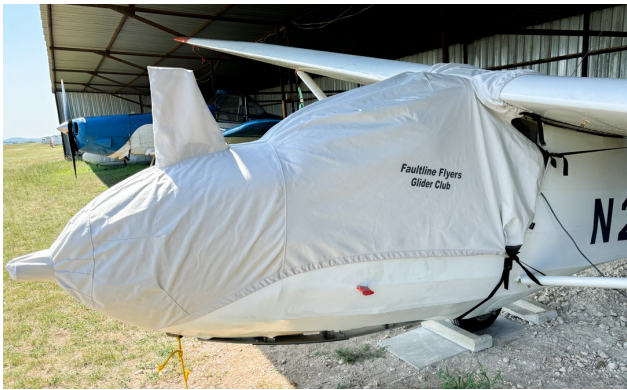
Schweizer SGS 2-33A Canopy/Nose Cover, All Year Use