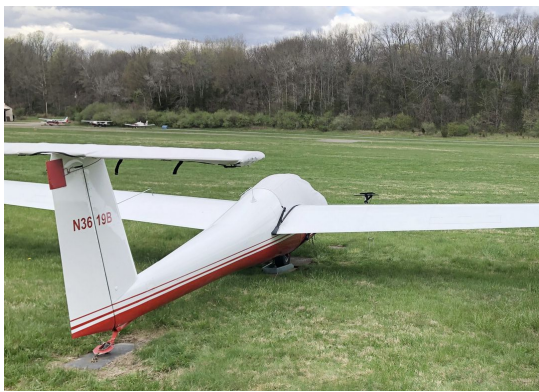
Schweizer 1-36 Canopy & Horiz. Stab. Covers

WINTER USE MATERIAL - Made with Solution-Dyed Polyester fabric, this option is intended for seasonal use to aid in deicing, rain mitigation, or for occasional travel. The material is lighter and more compact, but more susceptible to UV damage and may have a shorter useful life if used continuously outside than the all-year use material.