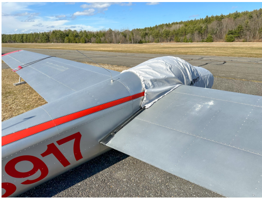
Schweizer SGS 1-26E

the hottest of days. It is water, ice and snow repellent, yet breathable to allow moisture to escape from between the cover and the aircraft surface.