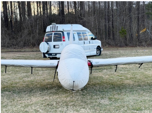
Schweizer SGS 2-32 Complete Cover Set

WINTER USE MATERIAL - Made with Solution-Dyed Polyester fabric, this option is intended for seasonal use to aid in deicing, rain mitigation, or for occasional travel. The material is lighter and more compact, but more susceptible to UV damage and may have a shorter useful life if used continuously outside than the all-year use material.