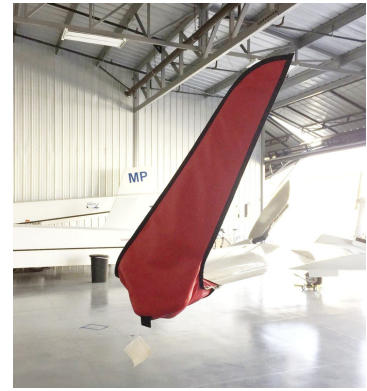
Schleicher ASH Wingtip Pads