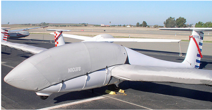
Grob 103 Canopy/Nose Cover and Wing Covers