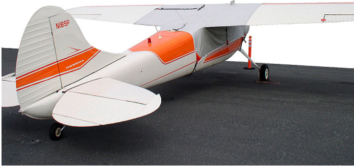
Cessna 195 Over-Top Canopy, Engine & Prop Covers

The material is very reflective, and tests show that the cabin interior temperature can be reduced to near-ambient temperature on the hottest of days. It is water, ice and snow repellent, yet breathable to allow moisture to escape from between the cover and the aircraft surface.