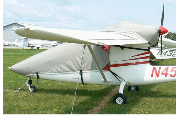
Sky Arrow Canopy/Nose & Engine Covers