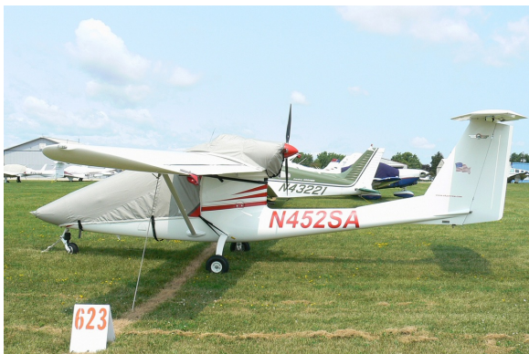
Sky Arrow Canopy & Engine Covers

This cover type is made from Silver Acrylic Sunbrella canvas and is 100% lined with a soft and smooth microfiber. Bruce's Custom Covers developed this material combination especially for aircraft protection. The outer material is medium weight and treated for water resistance, UV resistance and anti-static buildup. The inner lining is a very soft and smooth microfiber to prevent scratching. The material is very reflective, and tests show that the cabin interior temperature can be reduced to near-ambient temperature on the hottest of days. It is water, ice and snow repellent, yet breathable to allow moisture to escape from between the cover and the aircraft surface.