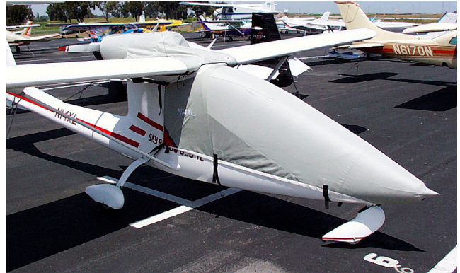
Sky Arrow Canopy & Engine Covers