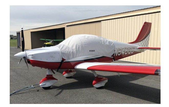
Airplane Factory Sling 2 Canopy Cover

This cover type is made from Silver Acrylic Sunbrella canvas and is 100% lined with a soft and smooth microfiber. Bruce's Custom Covers developed this material combination especially for aircraft protection. The outer material is medium weight and treated for water resistance, UV resistance and anti-static buildup. The inner lining is a very soft and smooth microfiber to prevent scratching. The material is very reflective, and tests show that the cabin interior temperature can be reduced to near-ambient temperature on the hottest of days. It is water, ice and snow repellent, yet breathable to allow moisture to escape from between the cover and the aircraft surface.