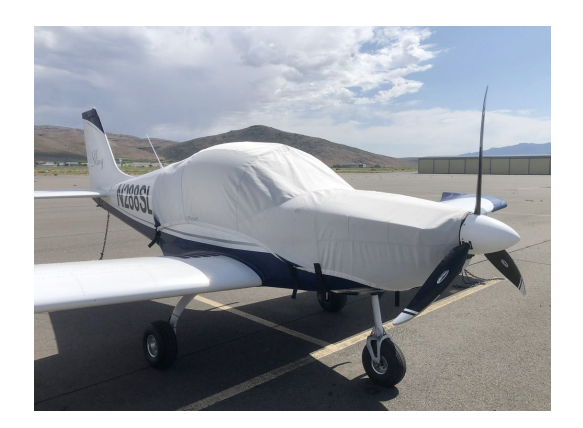
Sling 2 Canopy/Engine Cover