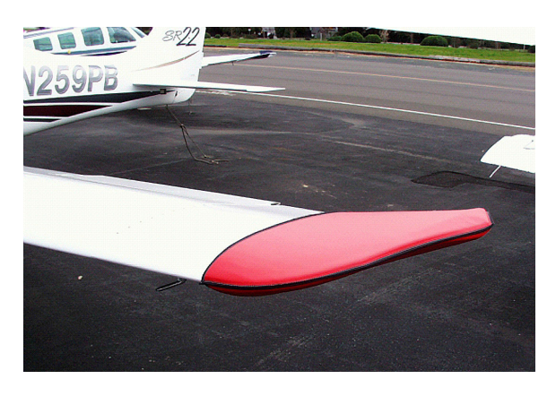
Cirrus SR-22 Wingtip Pad (also available for the Horiz. Stab.