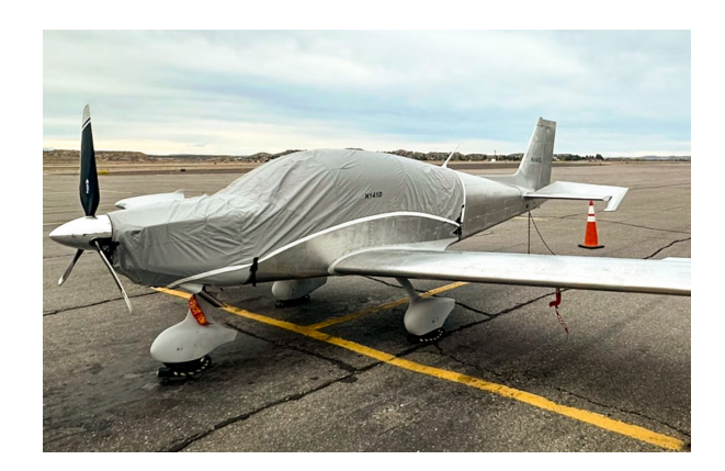
Sling TSi Travel Weight Canopy/Engine Cover