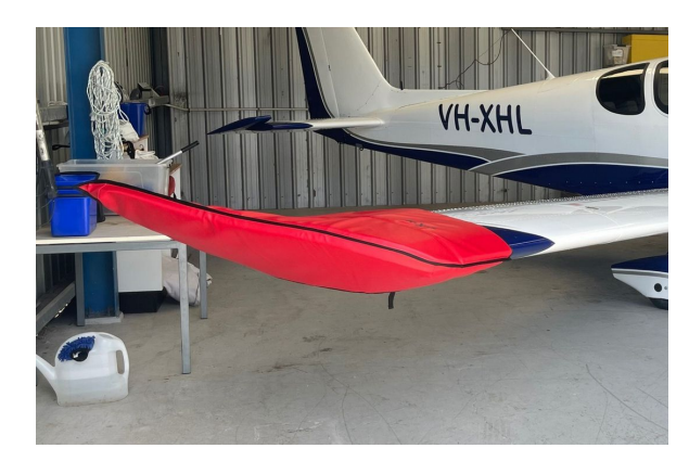
Sling TSI Wingtip Pads

Designed to prevent damage to the aircraft extremities in crowded hangars, these products are made of bright red Naugahyde and thickly padded with a sandwich of closed cell foam.