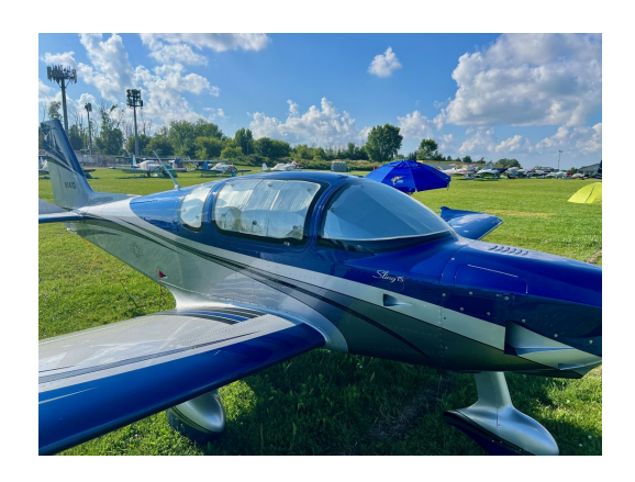
Airplane Factory Sling TSi HeatShield Set