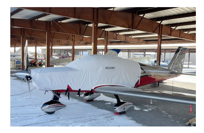
Airplane Factory Sling TSI Extended Canopy/Engine Cover