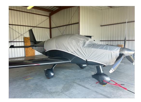
Sling TSI Travel Cover, Light Weight Canopy/Engine Cover

Travel Covers are made with Silver Solution-Dyed Polyester fabric and only lined over the windshield to save weight. The material is lightweight and more compact for easy stowage in the aircraft. The polyester material is water resistant, but only intended for occasional use outside. We also have an ultra lightweight material available for fitted hangar dust covers. For daily outdoor use, the non-travel Sunbrella Cover is the best choice.