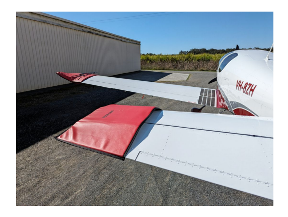
Sling TSI Horizontal Stabilizer Tip Pads