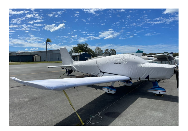
Sling 4 TSi Complete Cover Set

WINTER USE MATERIAL - Made with Solution-Dyed Polyester fabric, this option is intended for seasonal use to aid in deicing, rain mitigation, or for occasional travel. The material is lighter and more compact, but more susceptible to UV damage and may have a shorter useful life if used continuously outside than the all-year use material.