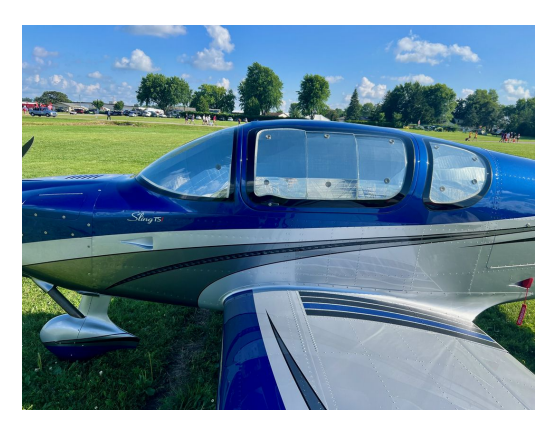
Airplane Factory Sling TSi HeatShield Set