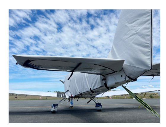
Sling 4 TSi Empennage Cover