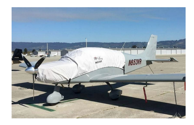
Airplane Factory Sling 4 Canopy/Engine Cover

This cover type is made from Silver Acrylic Sunbrella canvas and is 100% lined with a soft and smooth microfiber. Bruce's Custom Covers developed this material combination especially for aircraft protection. The outer material is medium weight and treated for water resistance, UV resistance and anti-static buildup. The inner lining is a very soft and smooth microfiber to prevent scratching. The material is very reflective, and tests show that the cabin interior temperature can be reduced to near-ambient temperature on the hottest of days. It is water, ice and snow repellent, yet breathable to allow moisture to escape from between the cover and the aircraft surface.