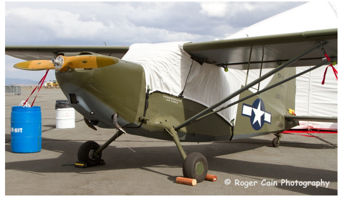
Stinson L-5 Canopy Cover