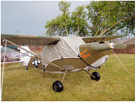
Stinson L-5 Canopy Cover