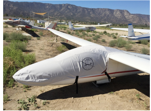
Pilatus B4 Canopy/Nose Cover