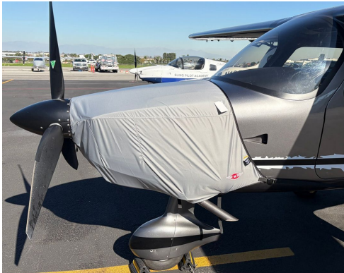
Sling High Wing Engine Cover

This cover type is made from Silver Acrylic Sunbrella canvas and is 100% lined with a soft and smooth microfiber. Bruce's Custom Covers developed this material combination especially for aircraft protection. The outer material is medium weight and treated for water resistance, UV resistance and anti-static buildup. The inner lining is a very soft and smooth microfiber to prevent scratching. The material is very reflective, and tests show that the cabin interior temperature can be reduced to near-ambient temperature on the hottest of days. It is water, ice and snow repellent, yet breathable to allow moisture to escape from between the cover and the aircraft surface.