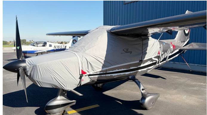
Sling High Wing Canopy Cover & Engine Cover