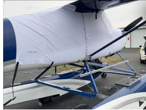
Glasair Sportsman Extended Over-Top Canopy Cover, test fit cover