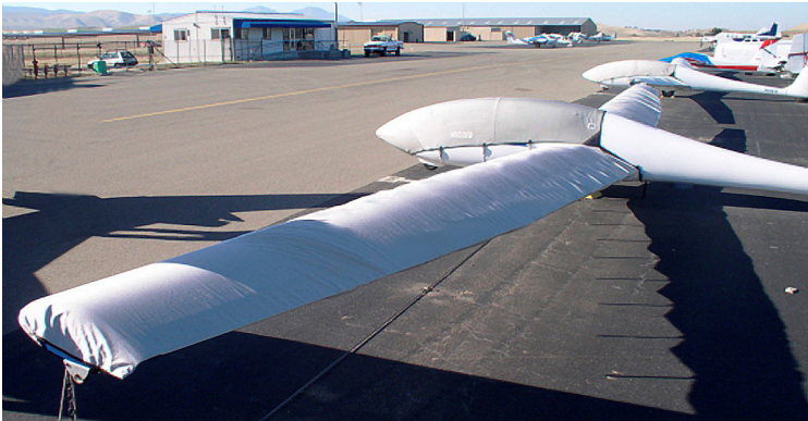
Grob 103 Canopy/Nose Cover and Wing Covers