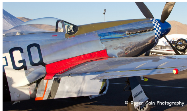
North American P-51 Wing Walk Pad