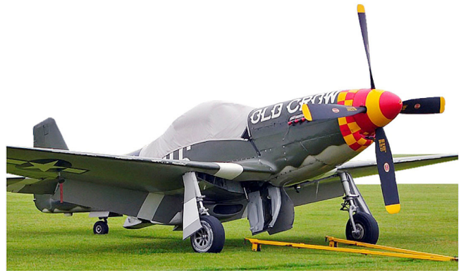
Canopy Cover, Chin Scoop & Exhaust Plugs