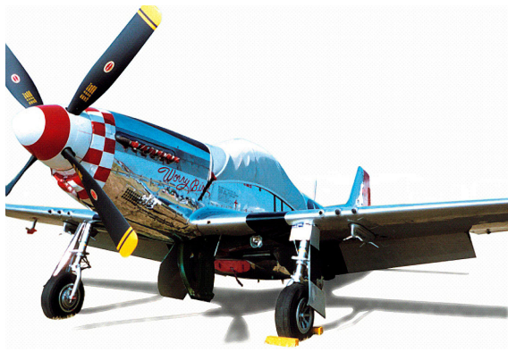
Canopy Cover, Belly & Chin Scoop Plugs