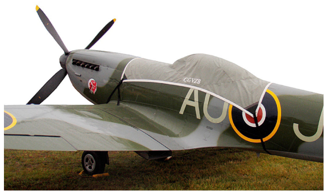
Supermarine Spitfire Mark 16 Canopy Cover