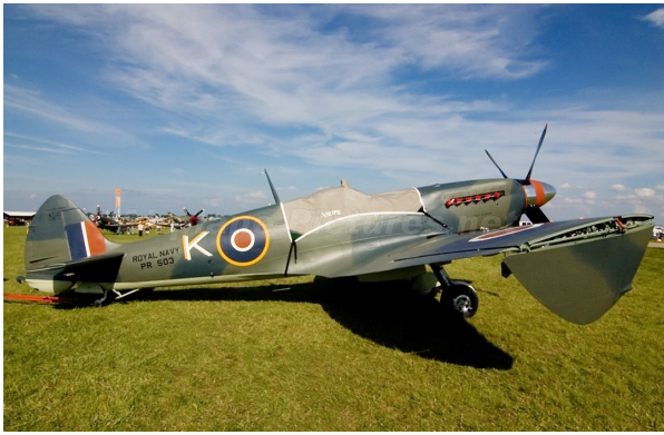
Supermarine Spitfire Mk IX Canopy Cover