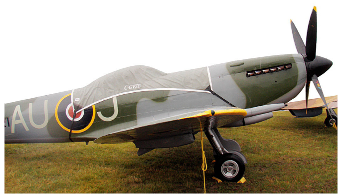
Supermarine Spitfire Mark 16 Canopy Cover