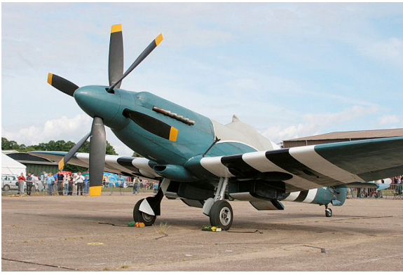
Supermarine Spitfire XIX Canopy Cover