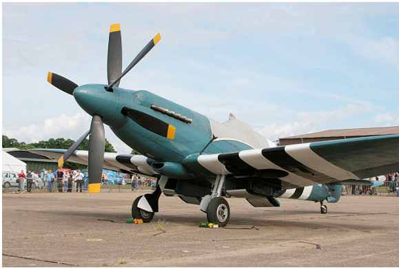
Supermarine Spitfire XIX Canopy Cover

Travel Covers are made with Silver Solution-Dyed Polyester fabric and only lined over the windshield to save weight. The material is lightweight and more compact for easy stowage in the aircraft. The polyester material is water resistant, but only intended for occasional use outside. We also have an ultra lightweight material available for fitted hangar dust covers. For daily outdoor use, the non-travel Sunbrella Cover is the best choice.