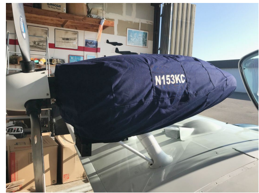
Seamax M22 Engine Cover