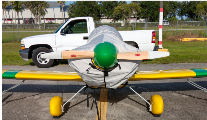
Sonerai Racer Engine Cover

The material is very reflective, and tests show that the cabin interior temperature can be reduced to near-ambient temperature on the hottest of days. It is water, ice and snow repellent, yet breathable to allow moisture to escape from between the cover and the aircraft surface.