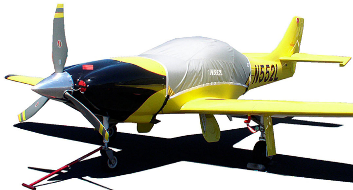
Canopy Cover for Lancair Legacy