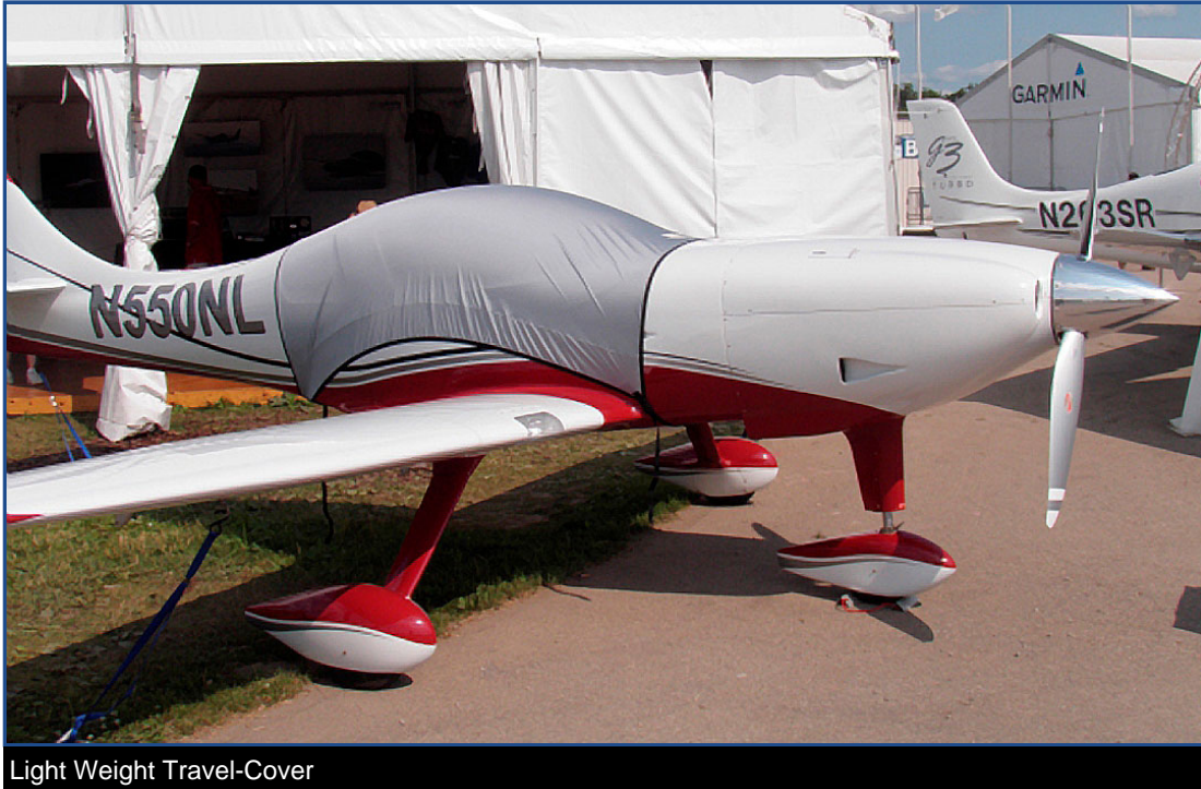
Light Weight Travel-Cover