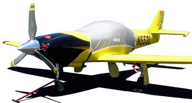
Canopy Cover for Lancair Legacy

This cover type is made from Silver Acrylic Sunbrella canvas and is 100% lined with a soft and smooth microfiber. Bruce's Custom Covers developed this material combination especially for aircraft protection. The outer material is medium weight and treated for water resistance, UV resistance and anti-static buildup. The inner lining is a very soft and smooth microfiber to prevent scratching. The material is very reflective, and tests show that the cabin interior temperature can be reduced to near-ambient temperature on the hottest of days. It is water, ice and snow repellent, yet breathable to allow moisture to escape from between the cover and the aircraft surface.