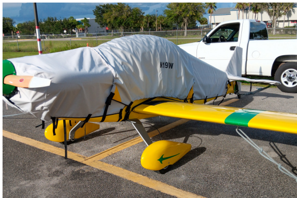
Sonerai Racer Extended Canopy Cover

This cover type is made from Silver Acrylic Sunbrella canvas and is 100% lined with a soft and smooth microfiber. Bruce's Custom Covers developed this material combination especially for aircraft protection. The outer material is medium weight and treated for water resistance, UV resistance and anti-static buildup. The inner lining is a very soft and smooth microfiber to prevent scratching. The material is very reflective, and tests show that the cabin interior temperature can be reduced to near-ambient temperature on the hottest of days. It is water, ice and snow repellent, yet breathable to allow moisture to escape from between the cover and the aircraft surface.