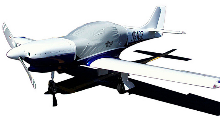
Canopy Cover for Lancair 320/360