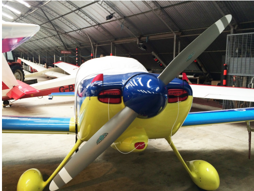
Van's RV-6 Engine Inlet Plugs

Engine Inlet Plugs are custom fit for your Sorrell Hiperbipe SNS-7 intakes, made with heavy-duty vinyl material, and stuffed with a single block of sculpted urethane foam. Each plug has a zipper that allows the foam to be removed and dried if necessary. Engine plugs have warning flags that are visible from the cockpit or 'remove before flight' streamers sewn onto the face of the plugs. Most plugs are imprinted with the aircraft registration number in black for an extra charge. Storage bag NOT included. Engine plugs may be inserted after flight when the engine is still warm. Engine Inlet Plugs are commonly referred to as Cowl Plugs, Intake Plugs, Cowl Blocks, Engine Blocks, and Engine Bungs.