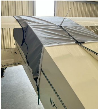
Sorrell SNS-7 Hiperbipe Over The Top Travel Canopy Cover

Travel Covers are made with Silver Solution-Dyed Polyester fabric and only lined over the windshield to save weight. The material is lightweight and more compact for easy stowage in the aircraft. The polyester material is water resistant, but only intended for occasional use outside. We also have an ultra lightweight material available for fitted hangar dust covers. For daily outdoor use, the non-travel Sunbrella Cover is the best choice.