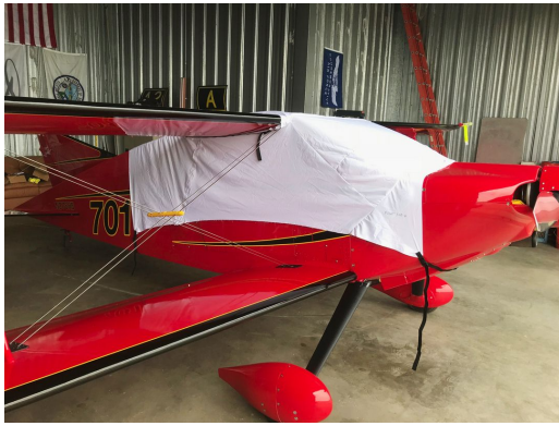
Sorrell Hiperbipe Canopy Cover (test fit cover)