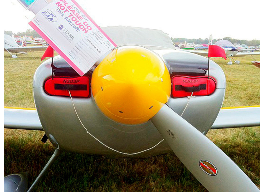
Vans's RV-7 Engine Engine Inlet Plugs