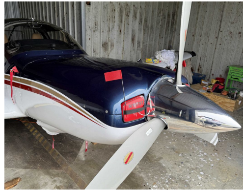
Micco SP-20 Engine Plugs