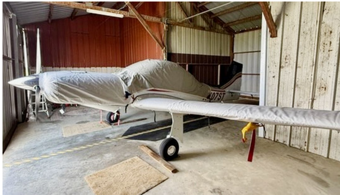
Micco SP20 Wing and Engine Covers