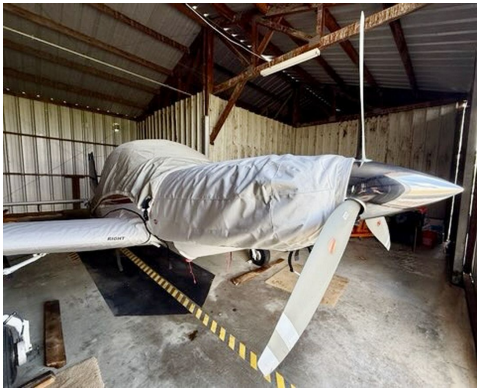
Micco SP20 Engine Cover

This cover type is made from Silver Acrylic Sunbrella canvas and is 100% lined with a soft and smooth microfiber. Bruce's Custom Covers developed this material combination especially for aircraft protection. The outer material is medium weight and treated for water resistance, UV resistance and anti-static buildup. The inner lining is a very soft and smooth microfiber to prevent scratching. The material is very reflective, and tests show that the cabin interior temperature can be reduced to near-ambient temperature on the hottest of days. It is water, ice and snow repellent, yet breathable to allow moisture to escape from between the cover and the aircraft surface.