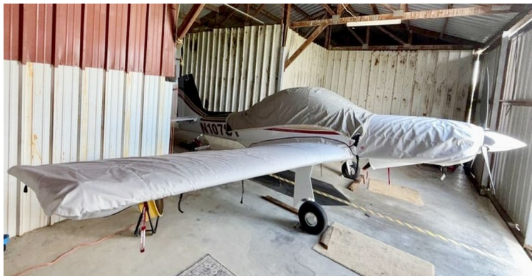
Micco SP20 Canopy Wing & Engine Covers