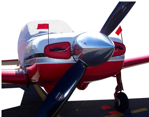
Micco SP20 Canopy Cover & Engine Inlet Plugs

The Micco SP20 Canopy/Engine Cover is a one-piece cover (100% lined with microfiber) that is a combination of the Canopy Cover and Engine Cover. This cover will enclose the engine cowl and will extend aft to cover all of the windows. This cover type is made from Silver Acrylic Sunbrella canvas and is 100% lined with a soft and smooth microfiber. Bruce's Custom Covers developed this material combination especially for aircraft protection. The outer material is medium weight and treated for water resistance, UV resistance and anti-static buildup. The inner lining is a very soft and smooth microfiber to prevent scratching. The material is very reflective, and tests show that the cabin interior temperature can be reduced to near-ambient temperature on the hottest of days. It is water, ice and snow repellent, yet breathable to allow moisture to escape from between the cover and the aircraft surface.