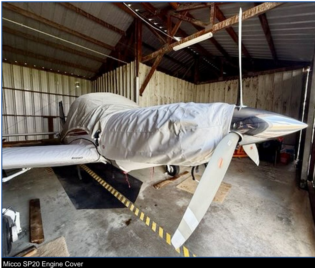
Micco SP20 Engine Cover