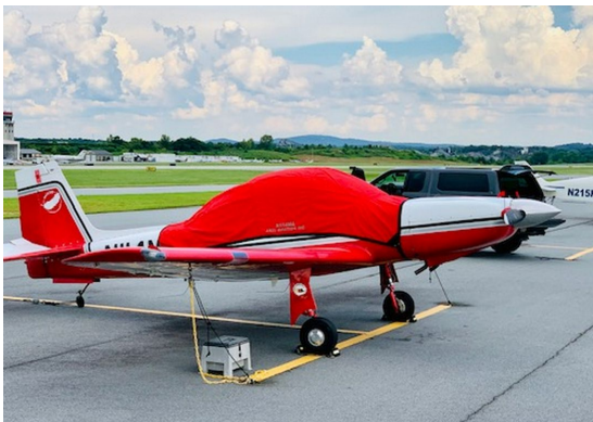
Micco SP20 Canopy Cover