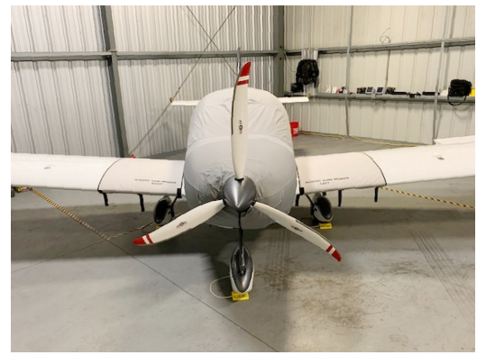
Czech Sport Travel Light Weight Canopy/Engine Cover, Wing Locker Covers