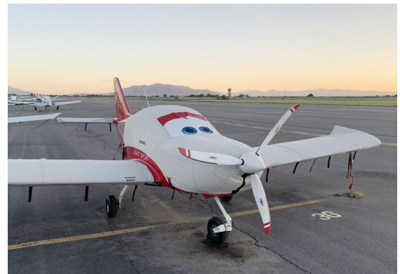
SportCruiser Canopy/Engine & Wing Covers