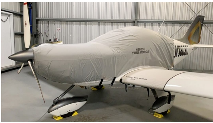
Czech Sport Travel Light Weight Canopy/Engine Cover, Wing Locker Covers