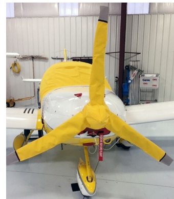
Custom Yellow Canopy Cover, Prop/Spinner, and Inlet Plugs