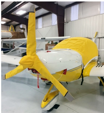
Custom Yellow Canopy Cover, Prop/Spinner, and Inlet Plugs

This cover type is made from Silver Acrylic Sunbrella canvas and is 100% lined with a soft and smooth microfiber. Bruce's Custom Covers developed this material combination especially for aircraft protection. The outer material is medium weight and treated for water resistance, UV resistance and anti-static buildup. The inner lining is a very soft and smooth microfiber to prevent scratching. The material is very reflective, and tests show that the cabin interior temperature can be reduced to near-ambient temperature on the hottest of days. It is water, ice and snow repellent, yet breathable to allow moisture to escape from between the cover and the aircraft surface.