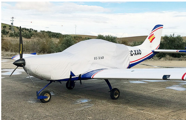
Czech Aircraft Works SportCruiser Canopy/Engine Cover

This cover type is made from Silver Acrylic Sunbrella canvas and is 100% lined with a soft and smooth microfiber. Bruce's Custom Covers developed this material combination especially for aircraft protection. The outer material is medium weight and treated for water resistance, UV resistance and anti-static buildup. The inner lining is a very soft and smooth microfiber to prevent scratching. The material is very reflective, and tests show that the cabin interior temperature can be reduced to near-ambient temperature on the hottest of days. It is water, ice and snow repellent, yet breathable to allow moisture to escape from between the cover and the aircraft surface.