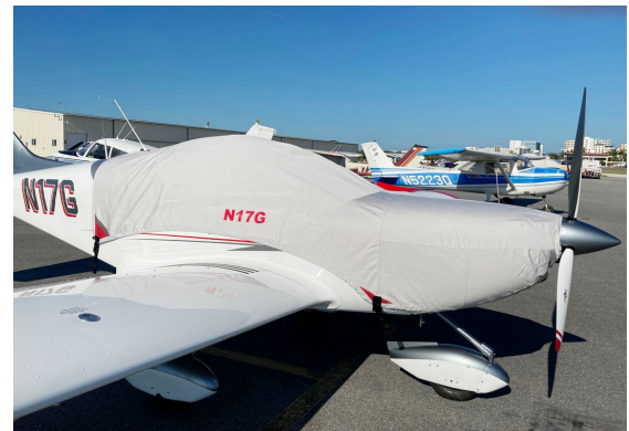
Czech Sportcruiser Canopy/Engine Cover