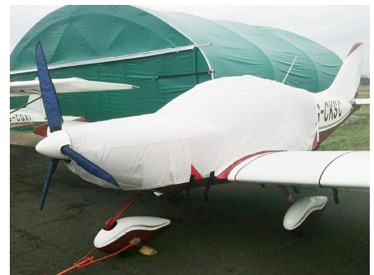
PiperSport Canopy/Engine Cover, Wing Locker Covers