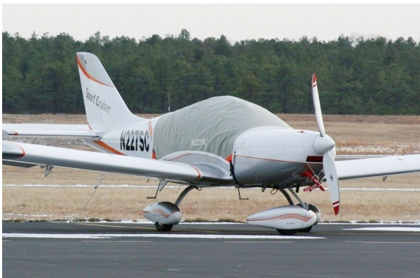
SPORTCRUISER CANOPY COVER

This cover type is made from Silver Acrylic Sunbrella canvas and is 100% lined with a soft and smooth microfiber. Bruce's Custom Covers developed this material combination especially for aircraft protection. The outer material is medium weight and treated for water resistance, UV resistance and anti-static buildup. The inner lining is a very soft and smooth microfiber to prevent scratching. The material is very reflective, and tests show that the cabin interior temperature can be reduced to near-ambient temperature on the hottest of days. It is water, ice and snow repellent, yet breathable to allow moisture to escape from between the cover and the aircraft surface.