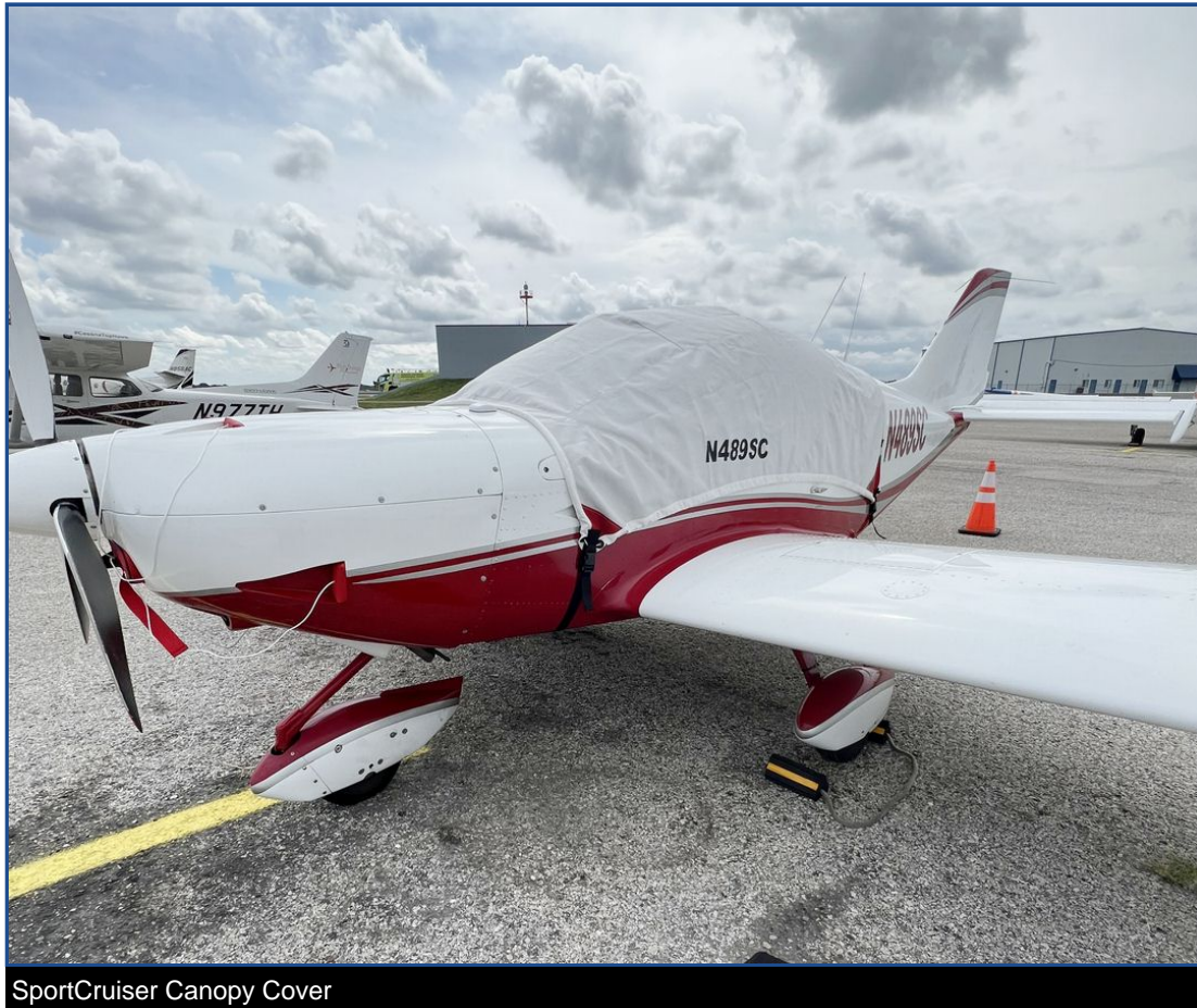
SportCruiser Canopy Cover