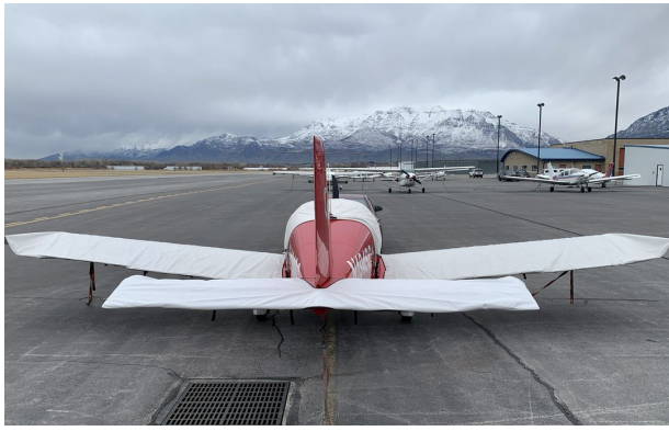
Sportcruiser Wing Covers