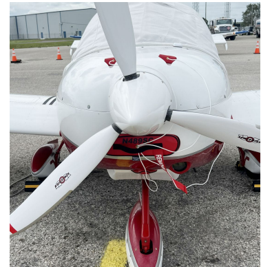
SportCruiser Engine Inlet Plugs