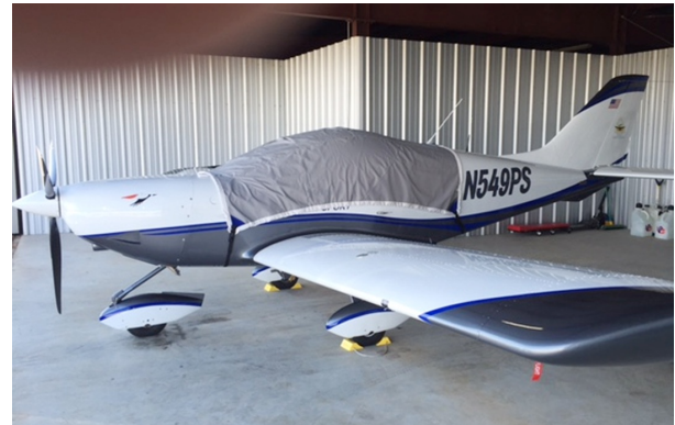
PiperSport Light Weight Travel Cover