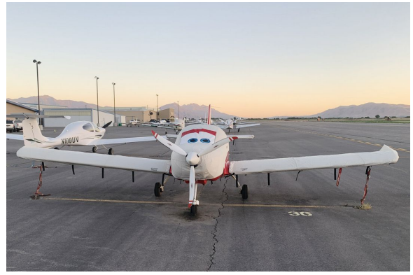
SportCruiser Canopy/Engine & Wing Covers