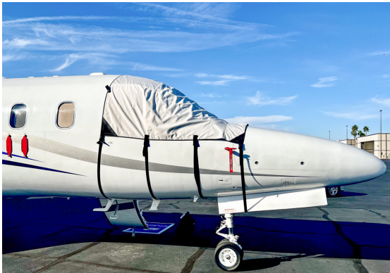
IAI Astron SPX Cockpit Cover