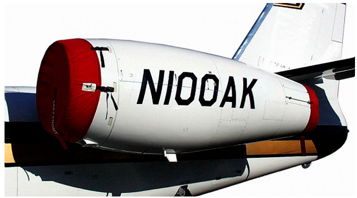
Engine Cover Set for the Astra