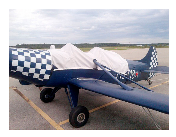
Spezio Tuholer Canopy Cover

The Spezio Tuholer Canopy/Engine Cover is a one-piece cover (100% lined with microfiber) that is a combination of the Canopy Cover and Engine Cover. This cover will enclose the engine cowl and will extend aft to cover all of the windows. This cover type is made from Silver Acrylic Sunbrella canvas and is 100% lined with a soft and smooth microfiber. Bruce's Custom Covers developed this material combination especially for aircraft protection. The outer material is medium weight and treated for water resistance, UV resistance and anti-static buildup. The inner lining is a very soft and smooth microfiber to prevent scratching. The material is very reflective, and tests show that the cabin interior temperature can be reduced to near-ambient temperature on the hottest of days. It is water, ice and snow repellent, yet breathable to allow moisture to escape from between the cover and the aircraft surface.