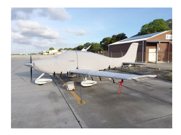
Cirrus SR20 Empennage Cover (covers tail boom, vertical and horizontal stabilizers)