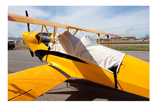
Bucker Jungmann Canopy Cover