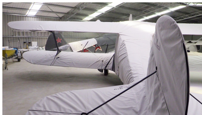
Beech Staggerwing Complete Cover Set