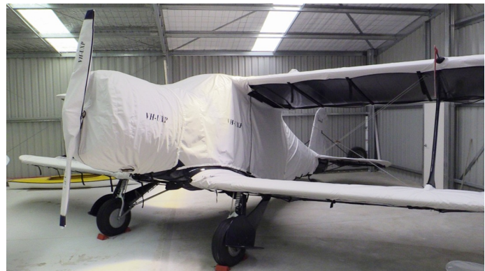
Beech Staggerwing Complete Cover Set