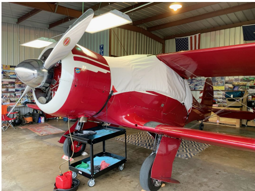
Beech Staggerwing D17S Canopy Cover