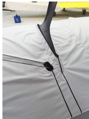
Beech Staggerwing Complete Cover Set, Lower Wing Detail