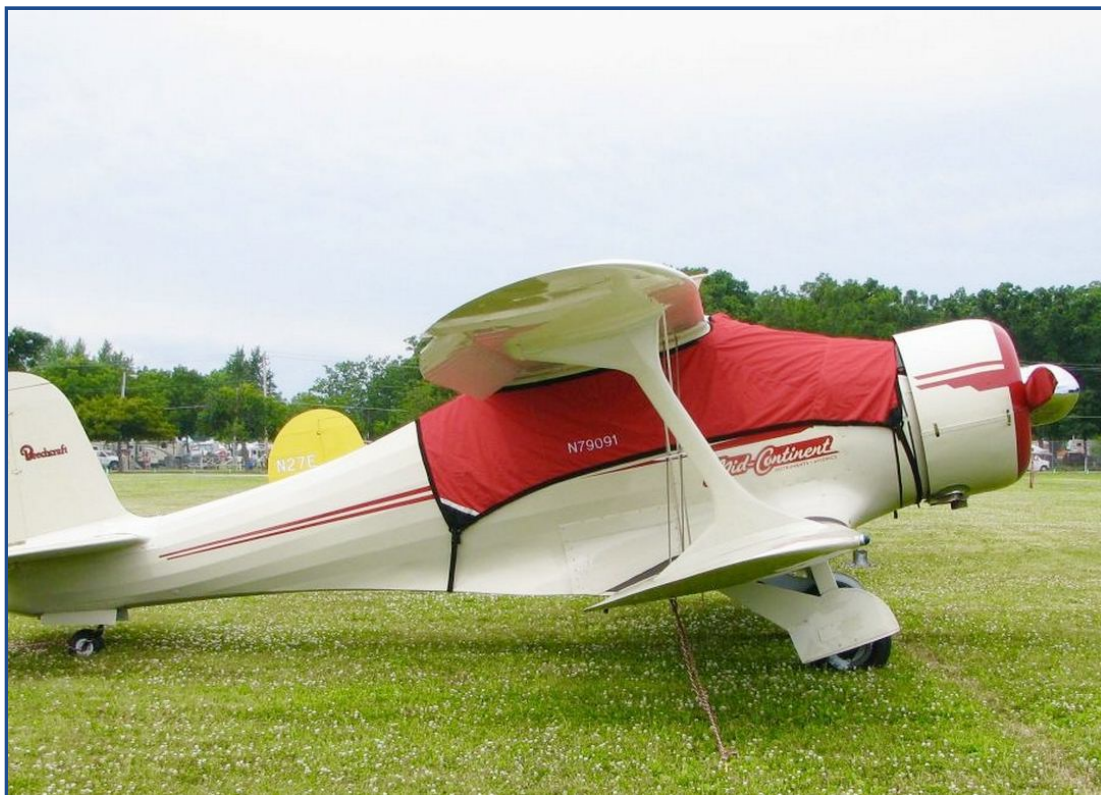
Beech Staggerwing Canopy Cover