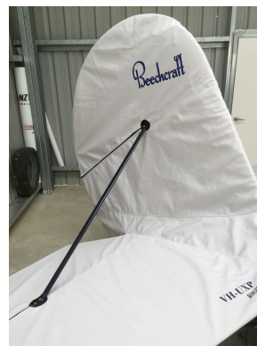
Beech Staggerwing Complete Cover Set, Tail Detail