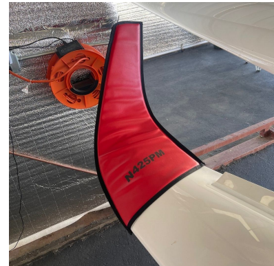
Stemme S-10 & S-12 Wingtip Pads