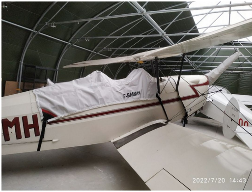
Stampe SV-4 Canopy Cover