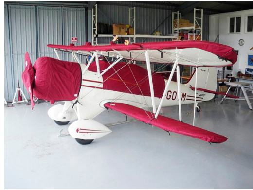
Waco UPF-7 Canopy, Wings, Stab's, Engine, Prop Covers