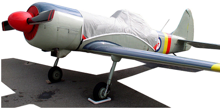
Yak 50 Canopy Cover

Covers developed this material combination especially for aircraft protection. The outer material is medium weight and treated for water resistance, UV resistance and anti-static buildup. The inner lining is a very soft and smooth microfiber to prevent scratching. The material is very reflective, and tests show that the cabin interior temperature can be reduced to near-ambient temperature on the hottest of days. It is water, ice and snow repellent, yet breathable to allow moisture to escape from between the cover and the aircraft surface.