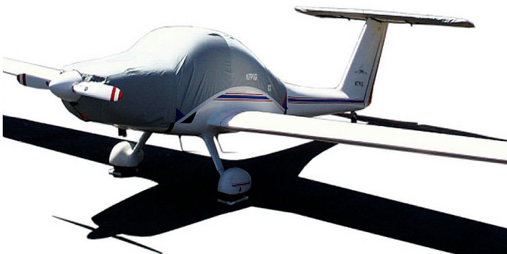
Grob 109 Canopy/Engine Cover & Horiz. Stabilizer Cover