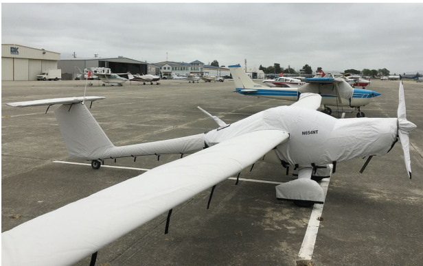
Distar Sundancer LSA Extended Canopy/Engine, Prop, Wheelpants, Wings & Empennage Covers