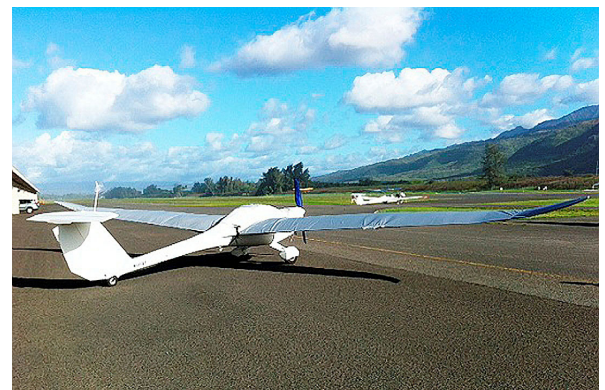
Distar Sundancer LSA Extended Canopy/Engine, Prop, Wheelpants, Wings & Empennage Covers Lambada Canopy/Engine Cover and Wing Covers