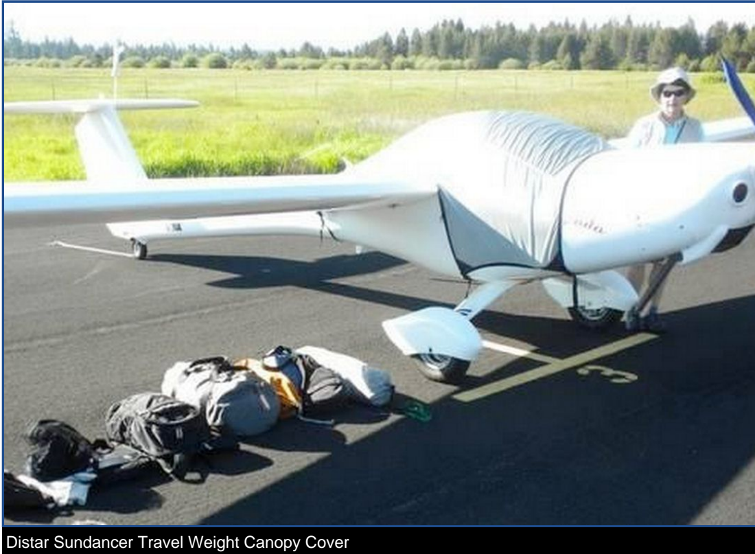
Distar Sundancer Travel Weight Canopy Cover