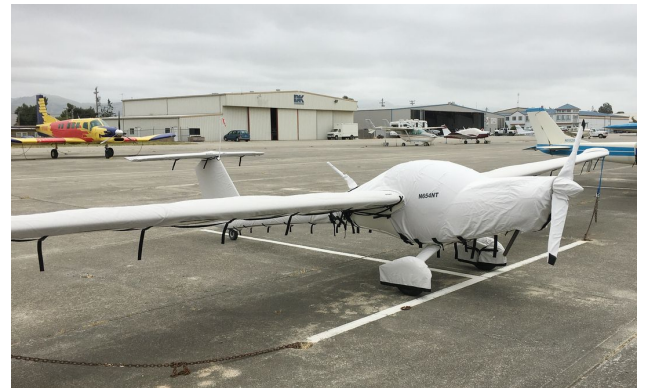
Distar Sundancer LSA Extended Canopy/Engine, Prop, Wheelpants, Wings & Empennage Covers