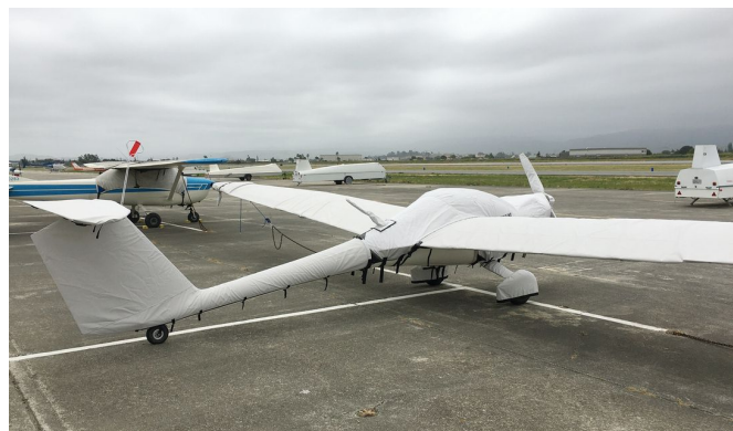
Lambda Canopy/Engine Cover and Wing Covers Distar Sundancer LSA Extended Canopy/Engine, Prop, Wheelpants, Wings & Empennage Covers