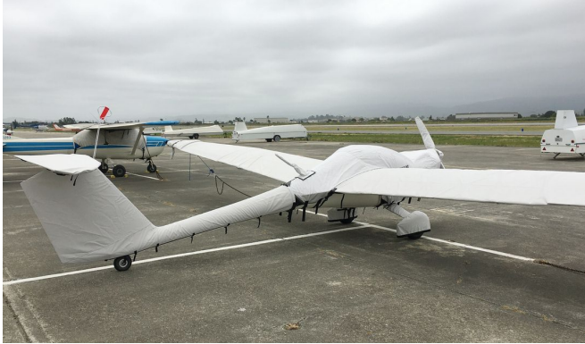
Distar Sundancer LSA Extended Canopy/Engine, Prop, Wheelpants, Wings & Empennage Covers