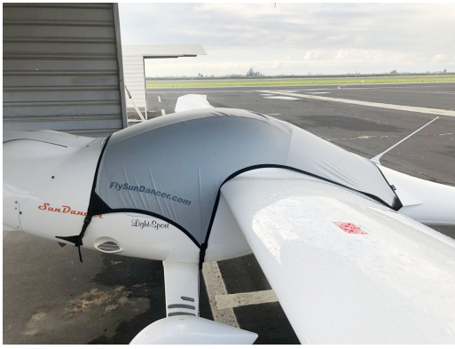
SUNDANCER Travel Cover with custom Imprint