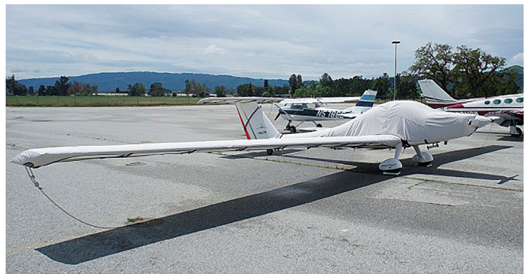
Grob 109 Canopy/Engine w/ extension to tail, Wing, Stabilizer & Prop/Spinner Covers