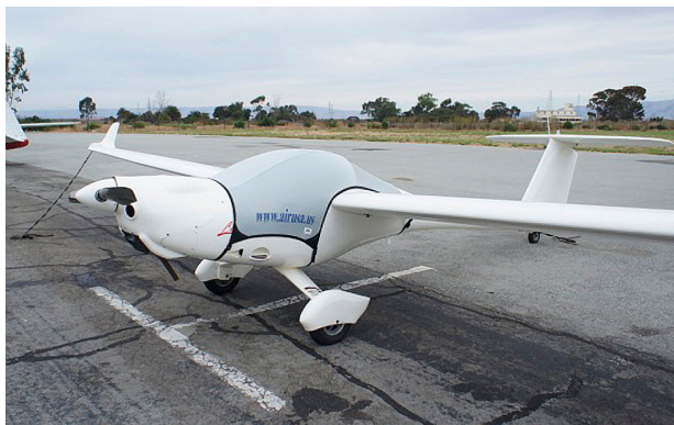
Lambda Canopy Cover